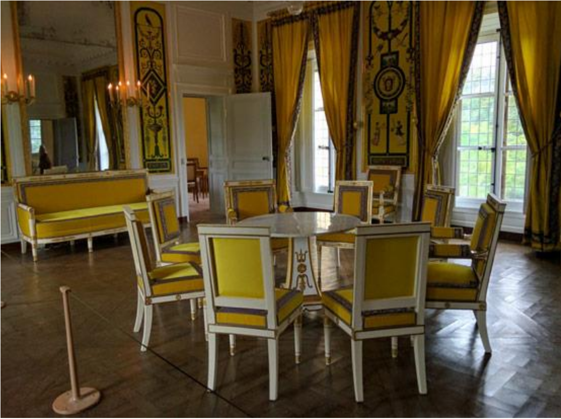
19th century furnishings are typical of the historic style of Napoleon's wife Empress Marie-Louise.