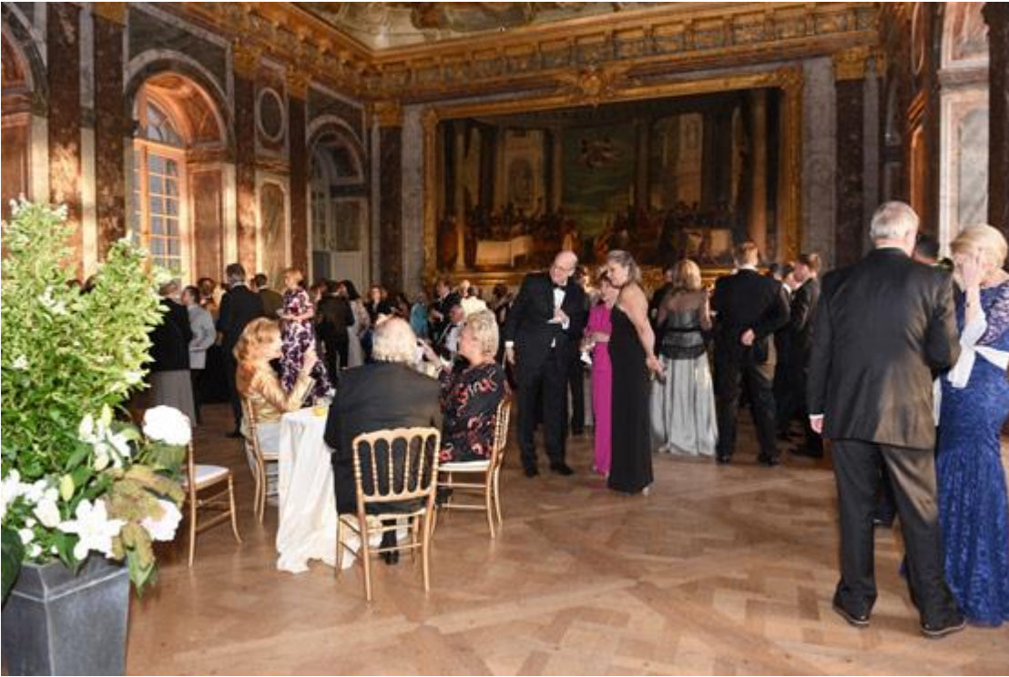
Sipping champagne among the splendors of the Salon d'Hercule, one of the grandest rooms in Versailles.