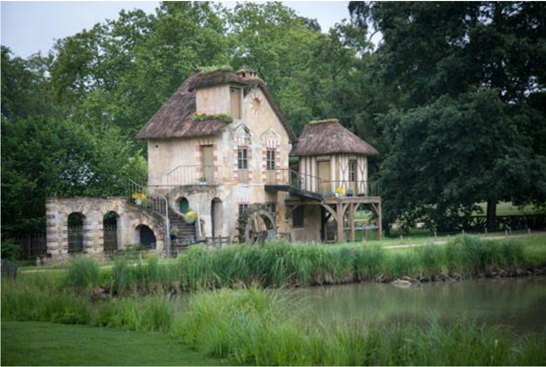
Marie Antoinette came to the Hameau to play at living a simpler life.