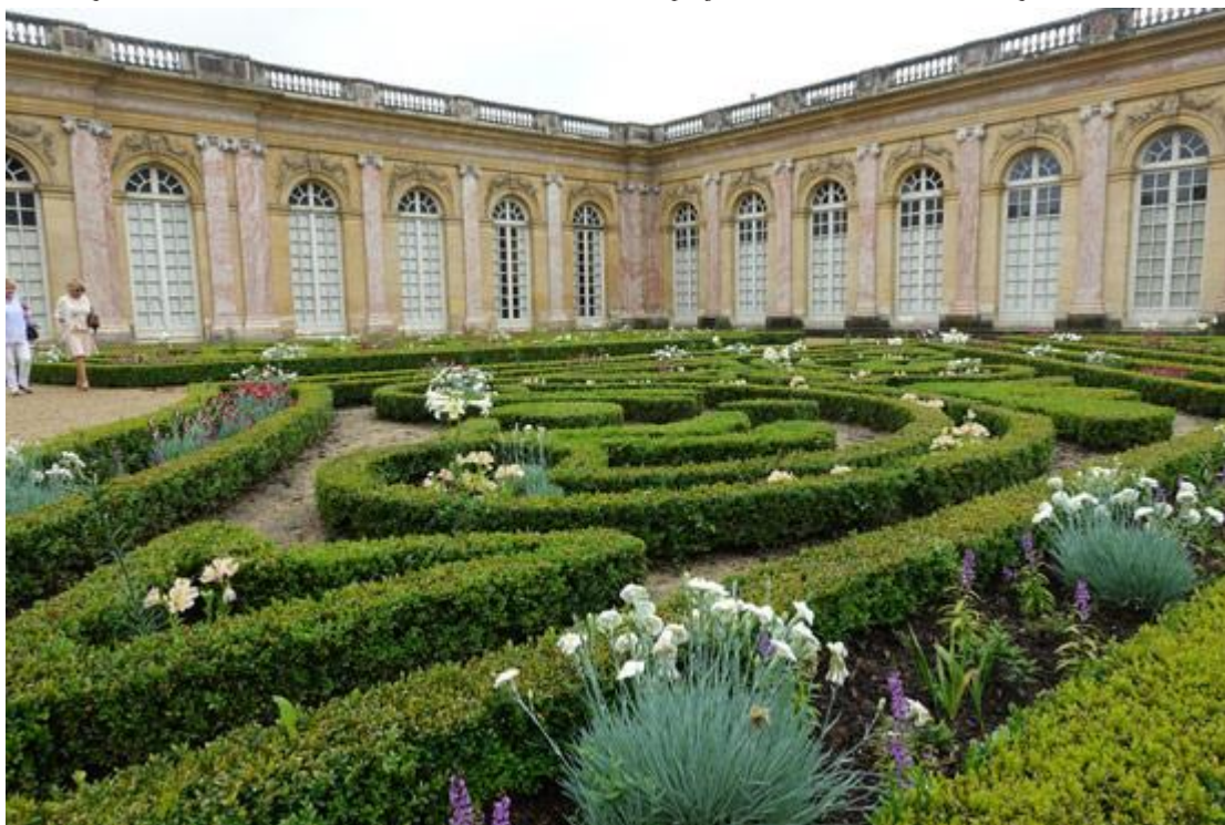
Lovely gardens surround the Trianon.

Admiring the portrayal of AFV's first restoration project, the Trois Fontaines Bosquet.