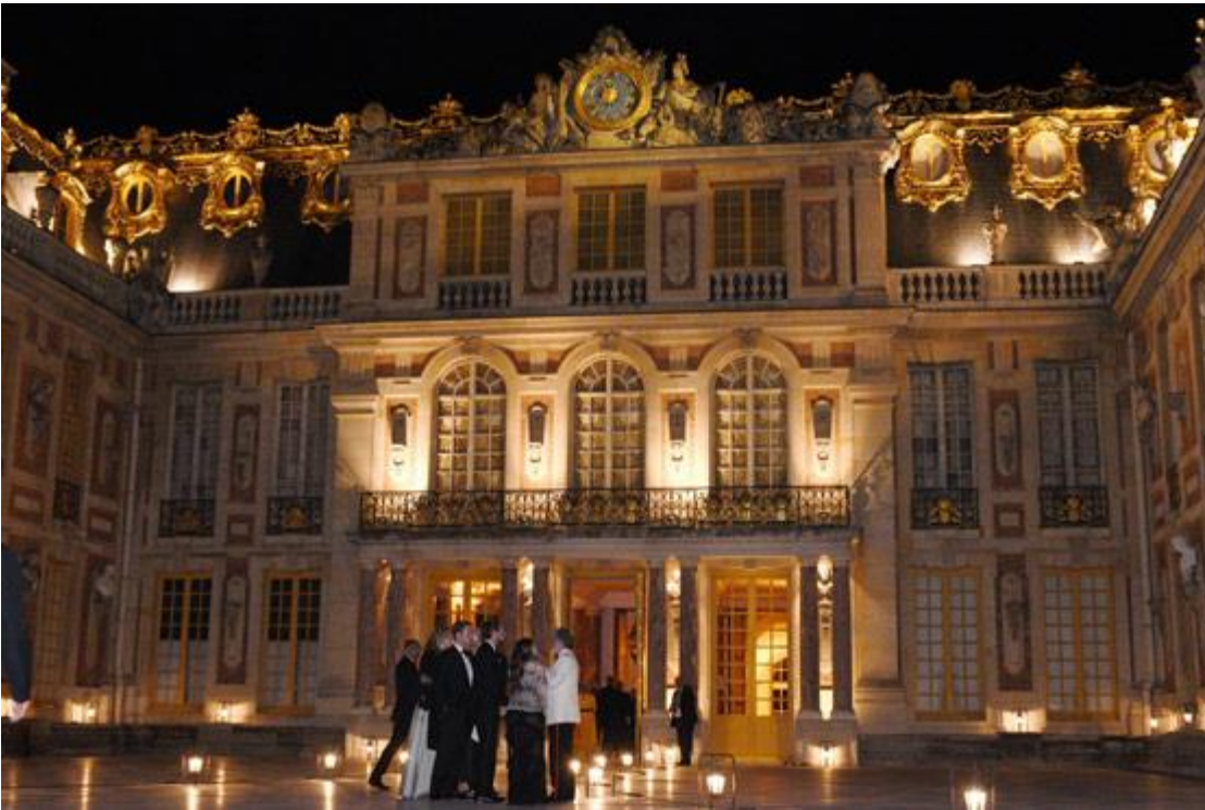
After the performance, guests proceeded to the palace terrace.