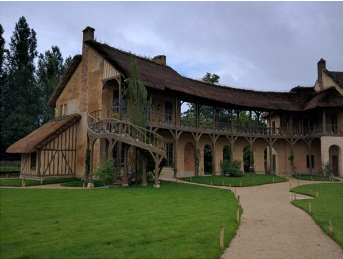
Multiple craftspeople, sponsored by Dior, restored the Hameau, which opened to the public in May 2018.