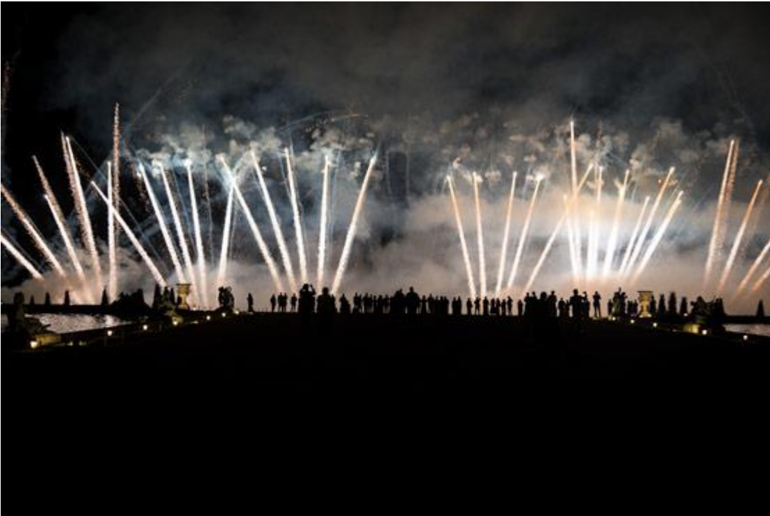
We gathered in the garden for a fireworks display.