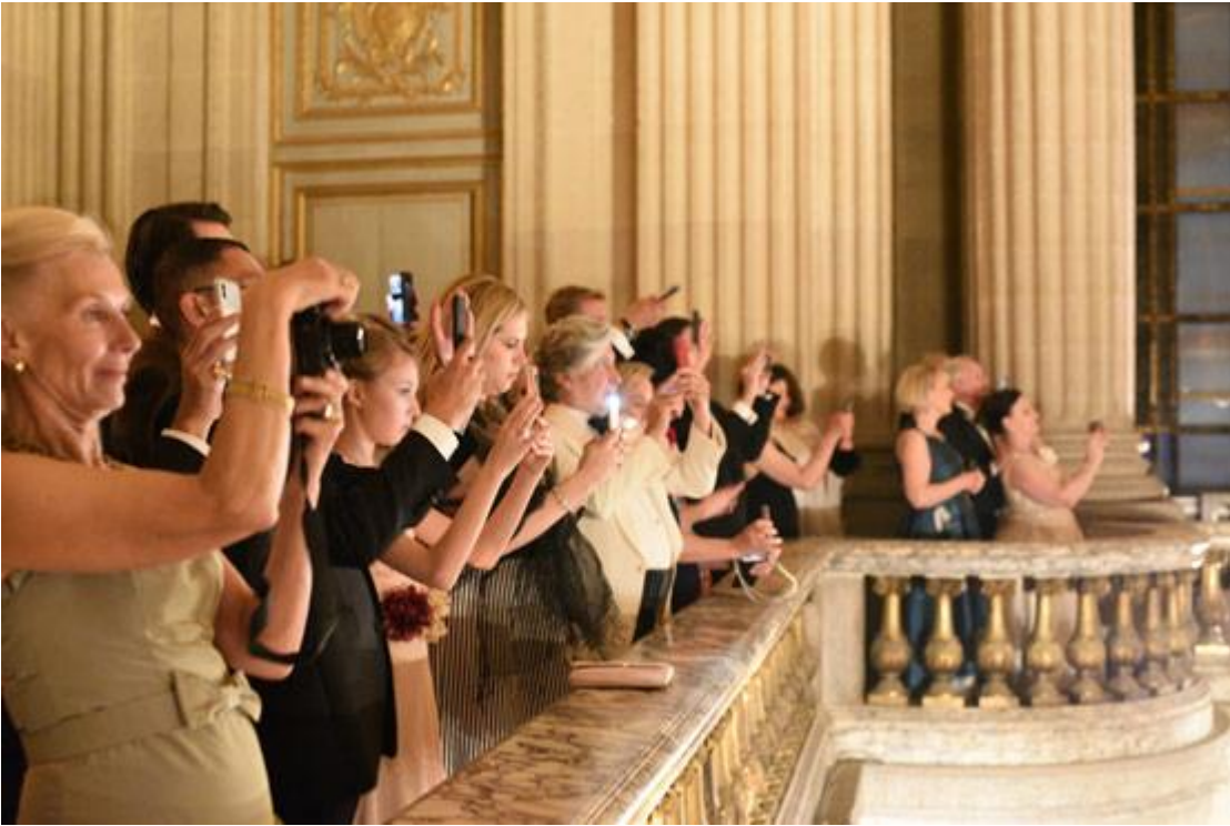
Guests snapped views of the historic chapel where seven-year-old Mozart once entertained Louis XV.