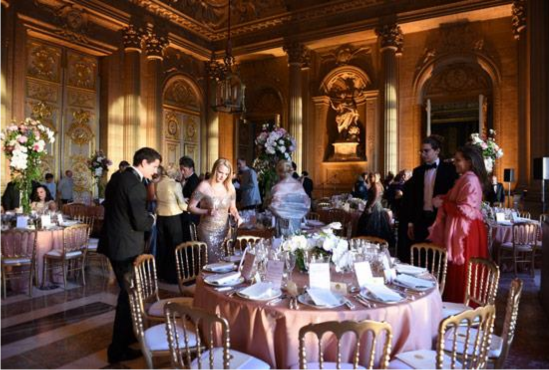
Dinner was presented in the Haut Vestibule of the Royal Chapel, one of the palace's grandest rooms.