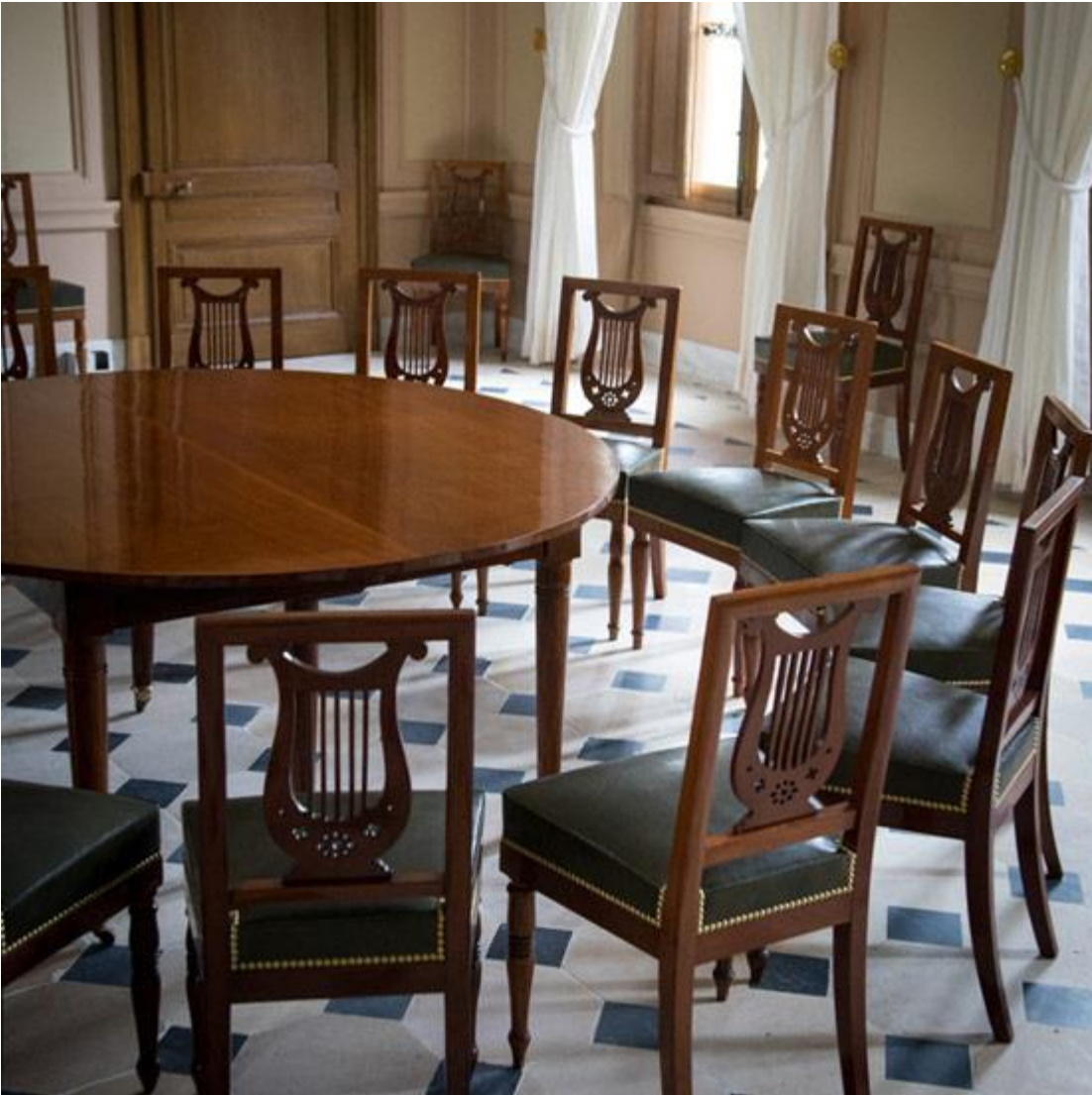
A dining area in the Hameau Games House.