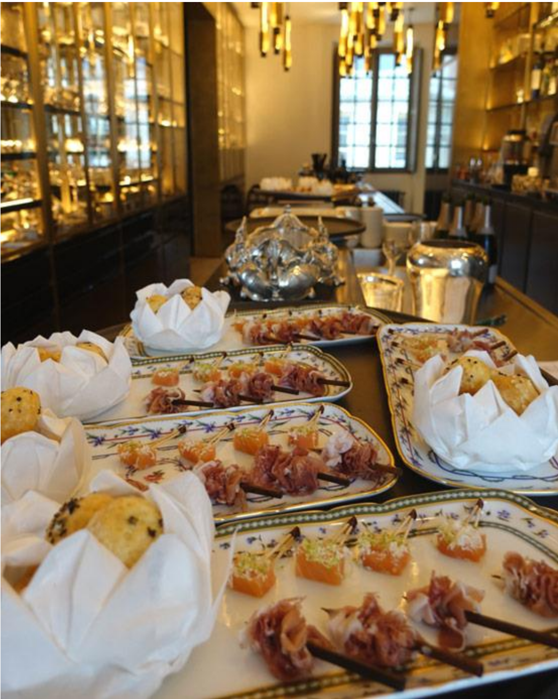
After private tours of Versailles, the group was served lunch at Ore, the new Alain Ducasse restaurant in the palace.