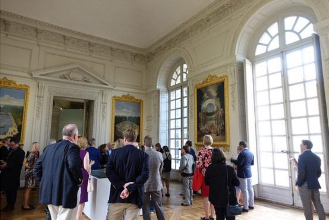
The AFV group previewed the exhibit before its opening that evening.