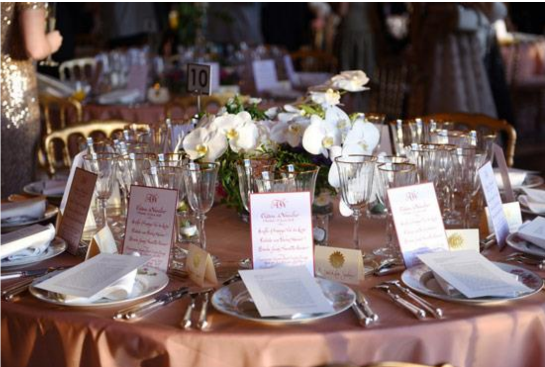
Tables were decorated to reflect the elegance of the setting.