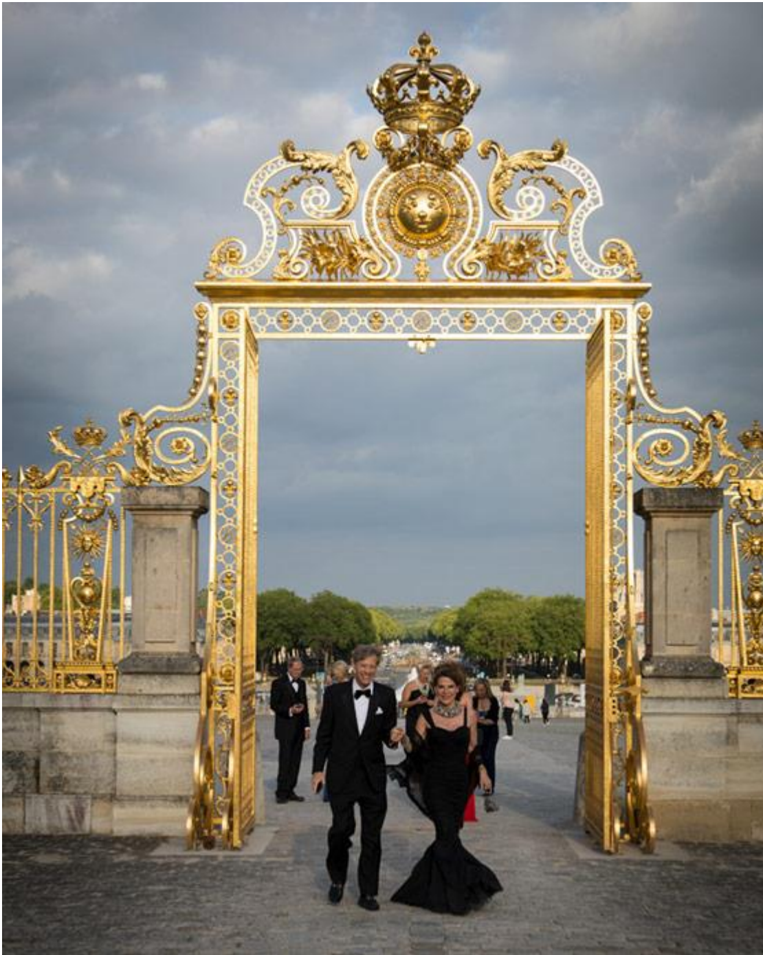
On Wednesday, the AFV group arrived at Versailles for a gala evening in the palace.