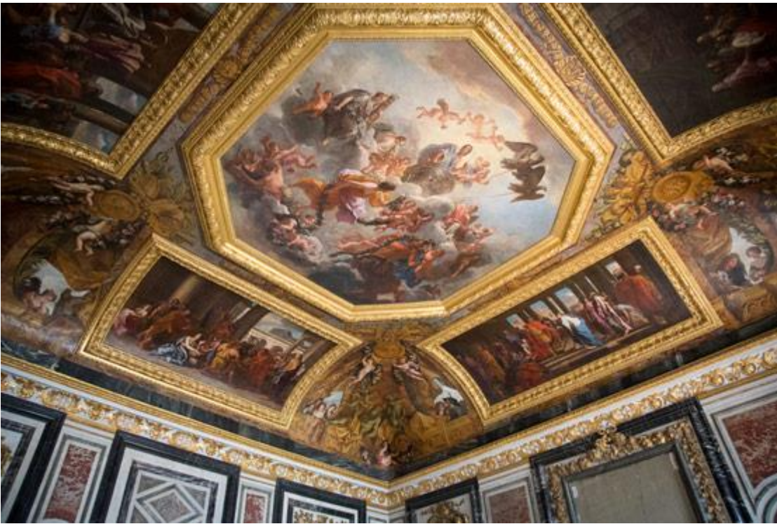
The restored ceiling, featuring the Chariot of Jupiter, was originally commissioned for Louis XIV.