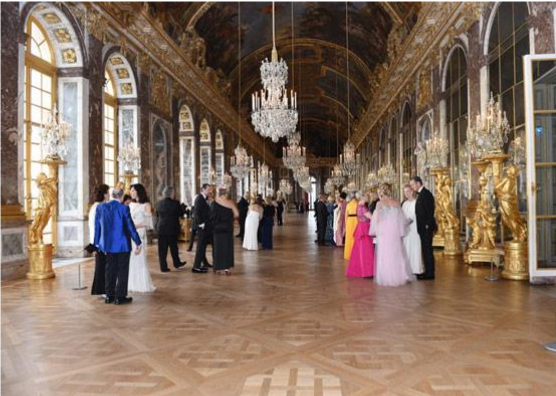
Champagne was served in the Hall of Mirrors.