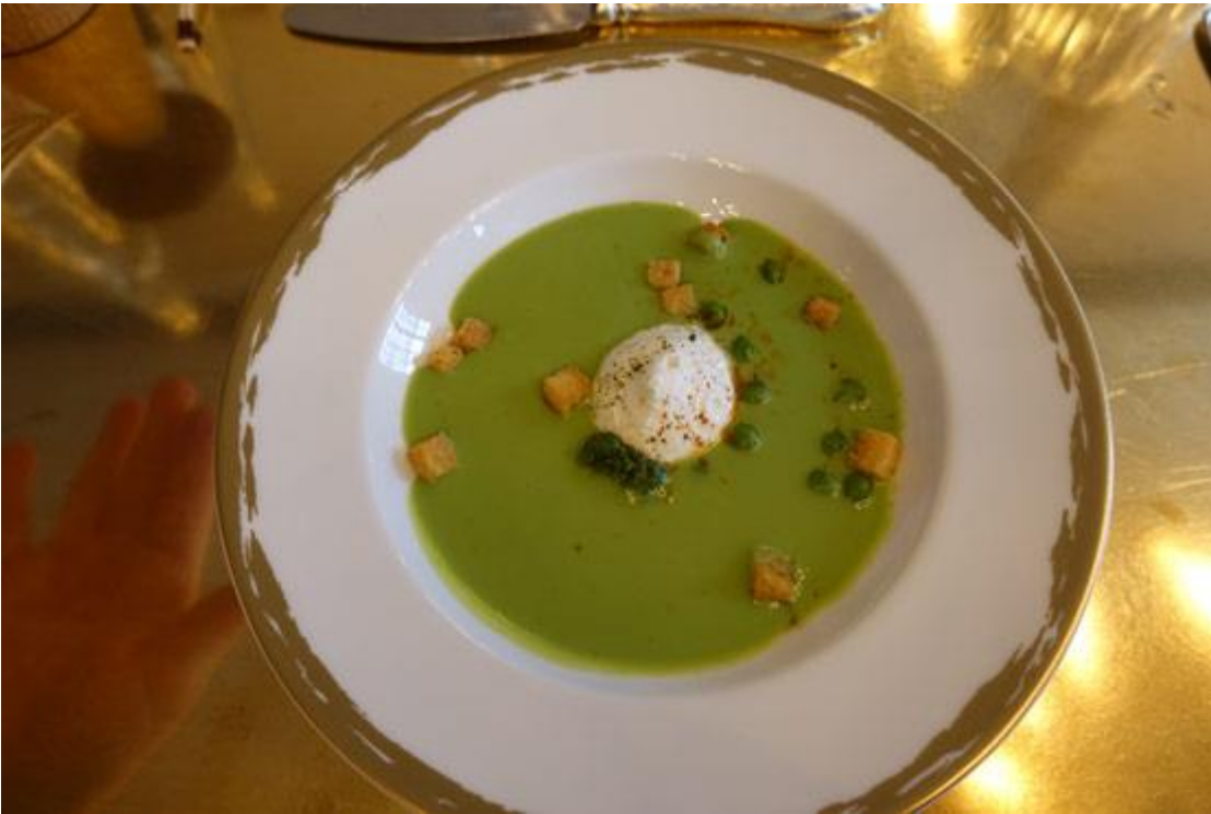
Chilled green pea soup was served with goat curd.