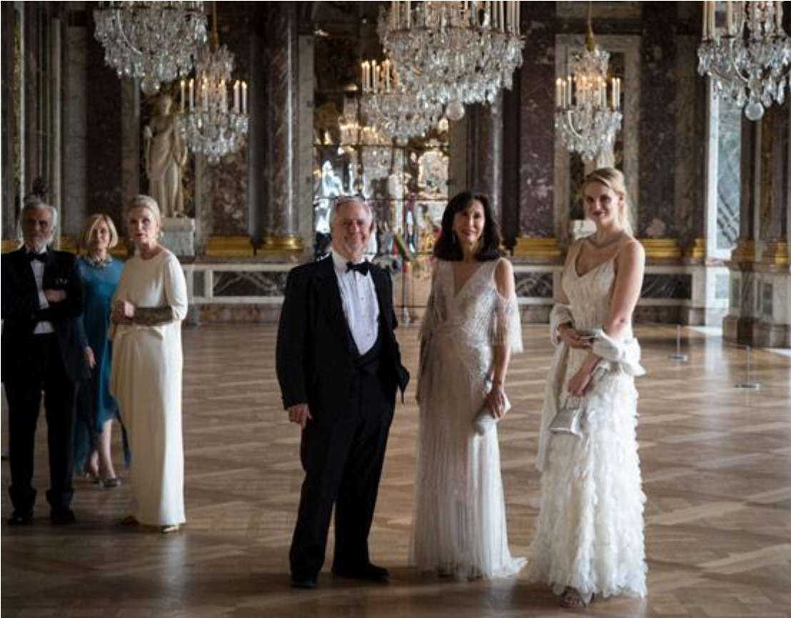
Admiring the historic decor.