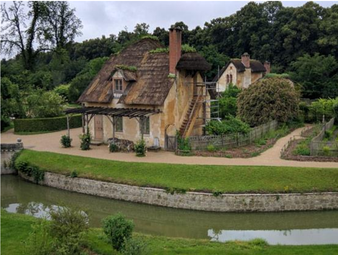
Dressed as a shepherdess, Marie Antoinette went to the Hameau to escape from the hustle and bustle of palace life.