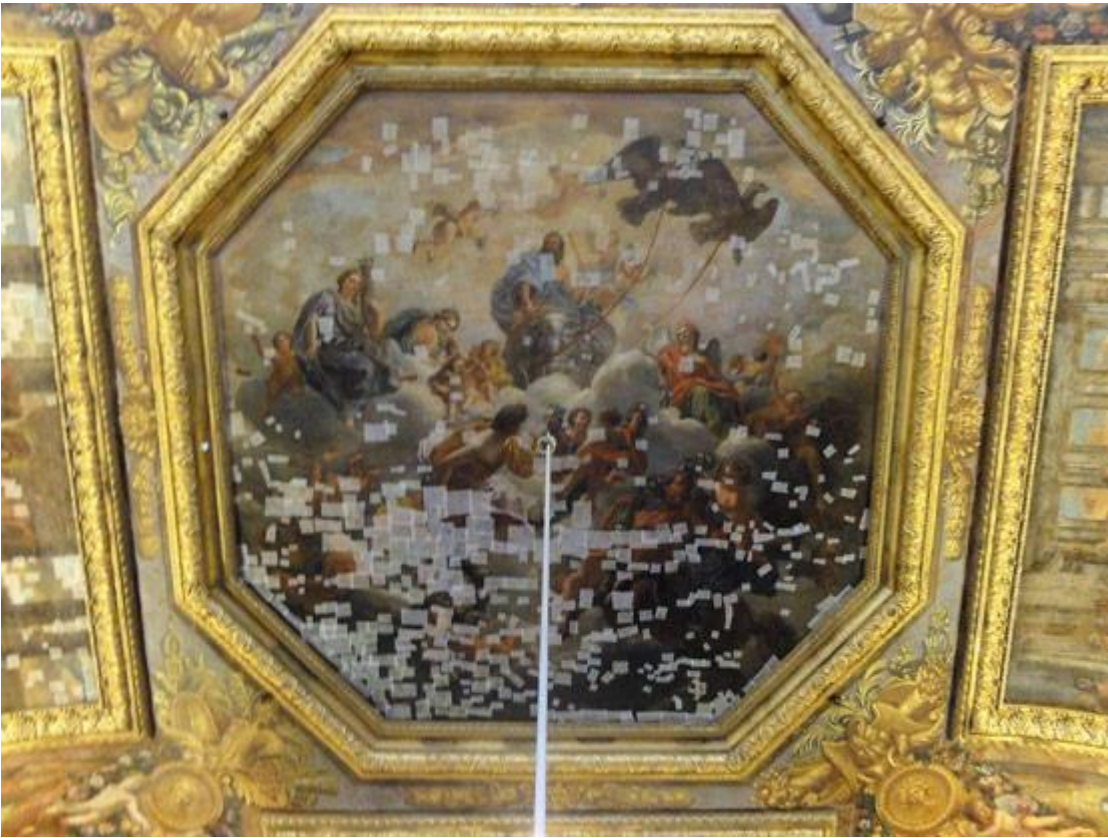
The ceiling of the Queen's Guard Room had deteriorated and required patching to hold it intact.