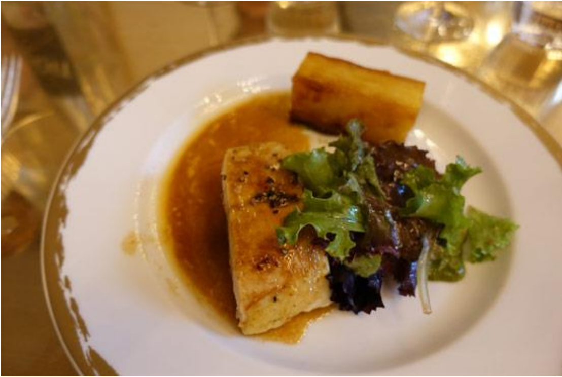
The main course was corn-fed chicken breast with Anna potatoes.