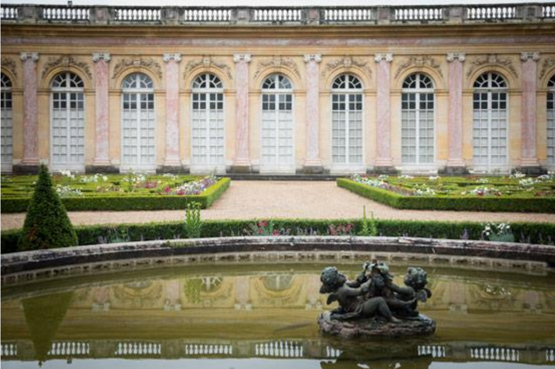
At the Trianon, we viewed an exhibit of 17th century Jean Cotelle paintings depicting Versailles garden bosquets.