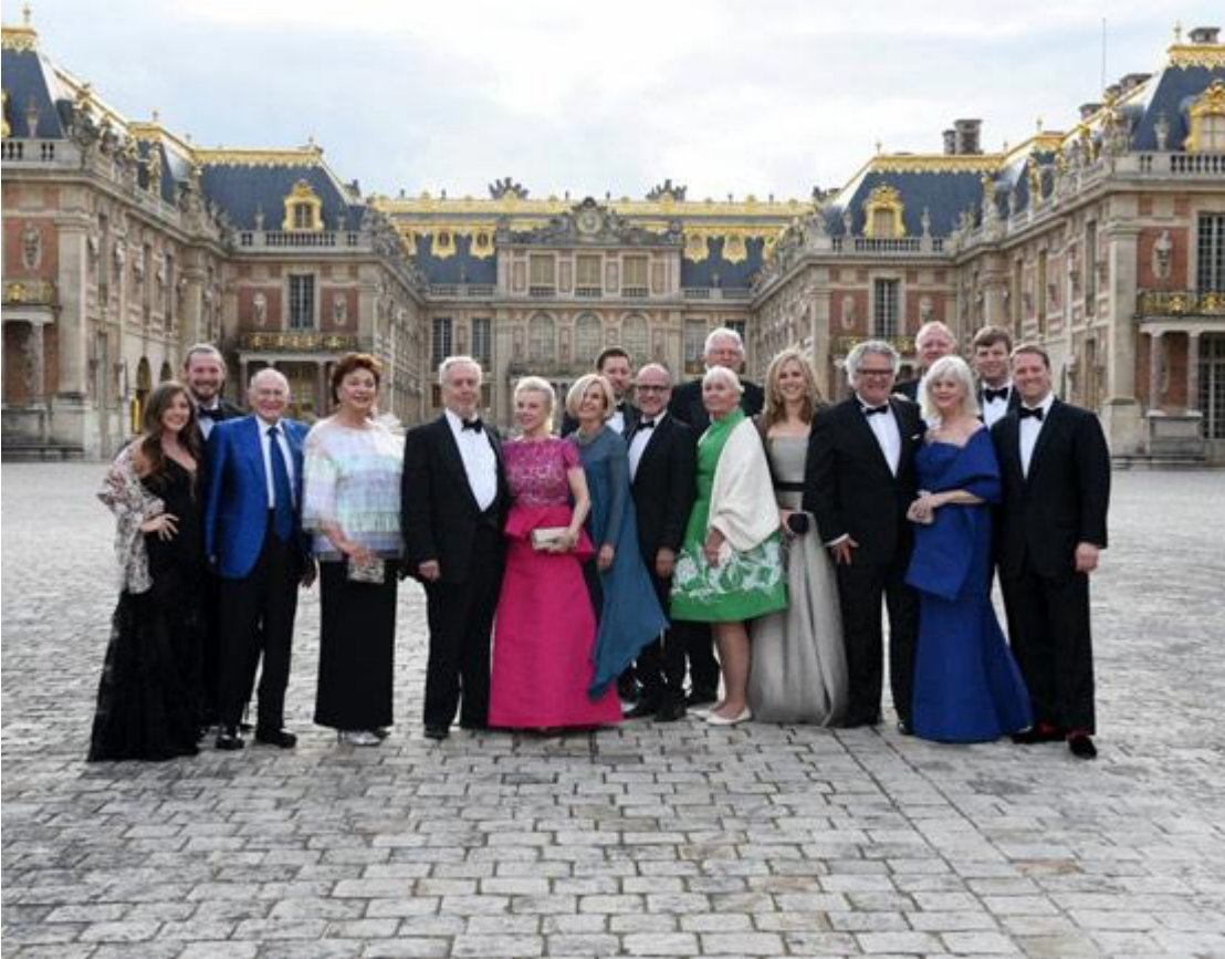
Several AFV members assembled in the courtyard.