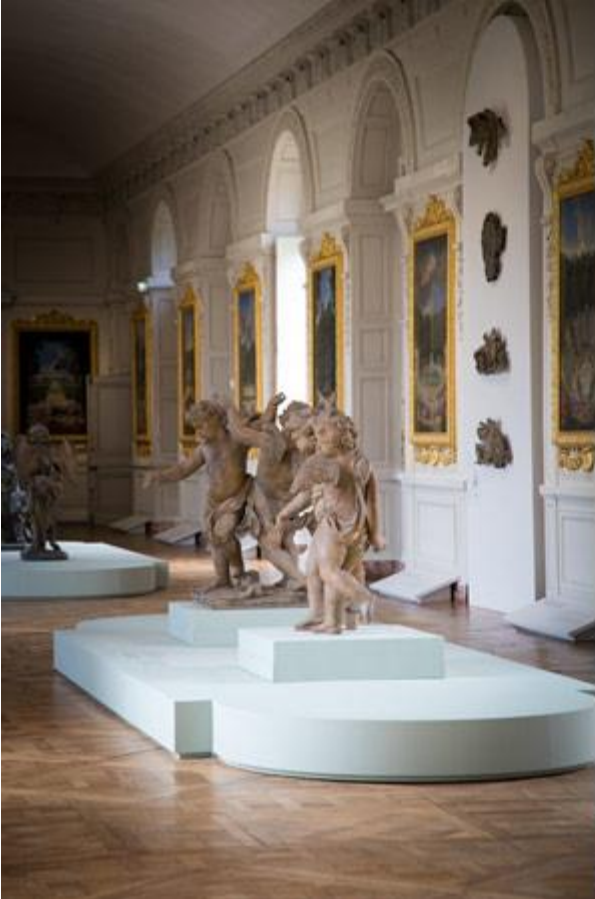
Cotelle's painting of the Bosquet de Trois Fontaines, the first project restored by the AFV.