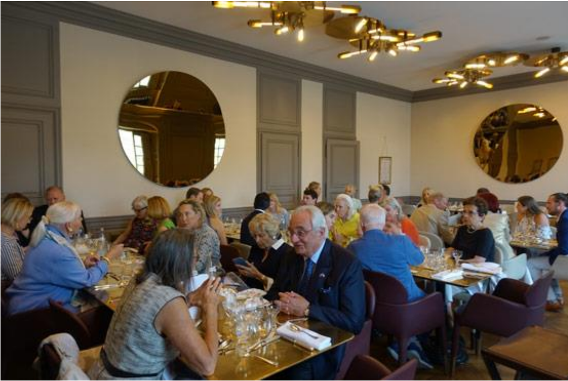
At Ore, seating consists of long, family-style tables.