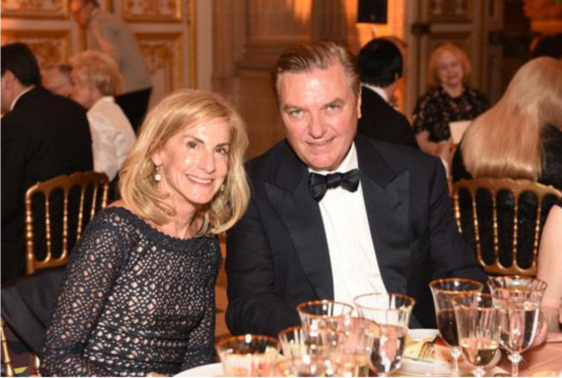
US Ambassador Jamie McCourt and HRH Prince Charles de Bourbon des Deux Siciles.