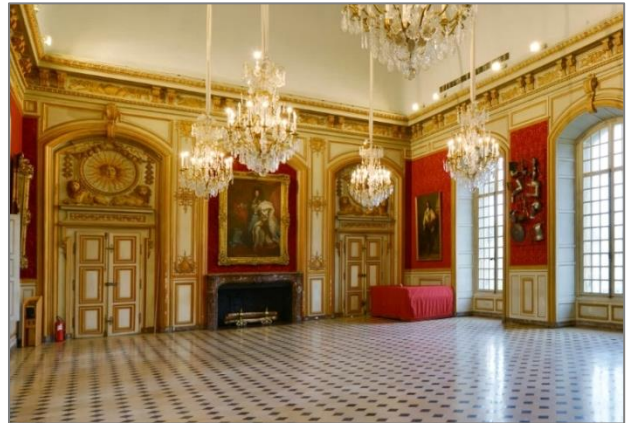
Hôtel des Invalides, Le Grand Salon