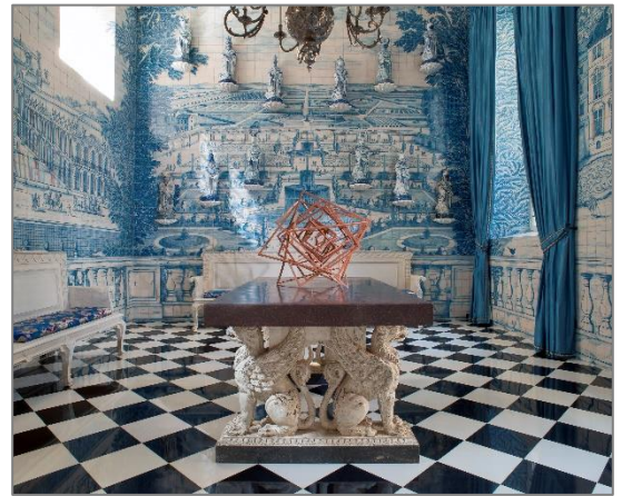
Foyer, Hôtel Claude Passart

UN GRAND MERCI TO ALL OUR HOSTS THIS YEAR, AS WELL AS TO ALL OF OUR PAST HOSTS SINCE 1998!! The American Friends of Versailles truly appreciates your magnanimous kindness and generosity.