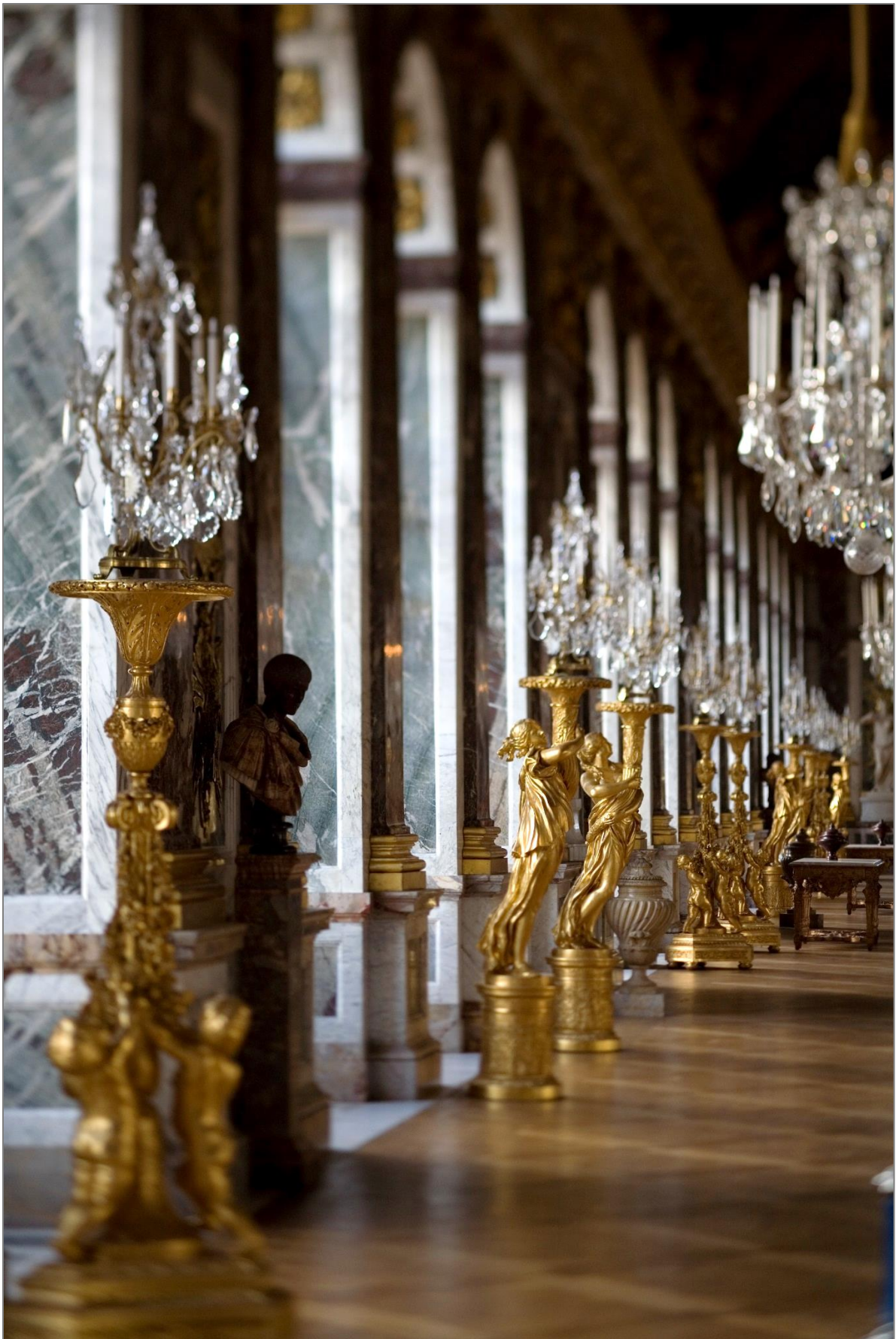
Galerie des Glaces.