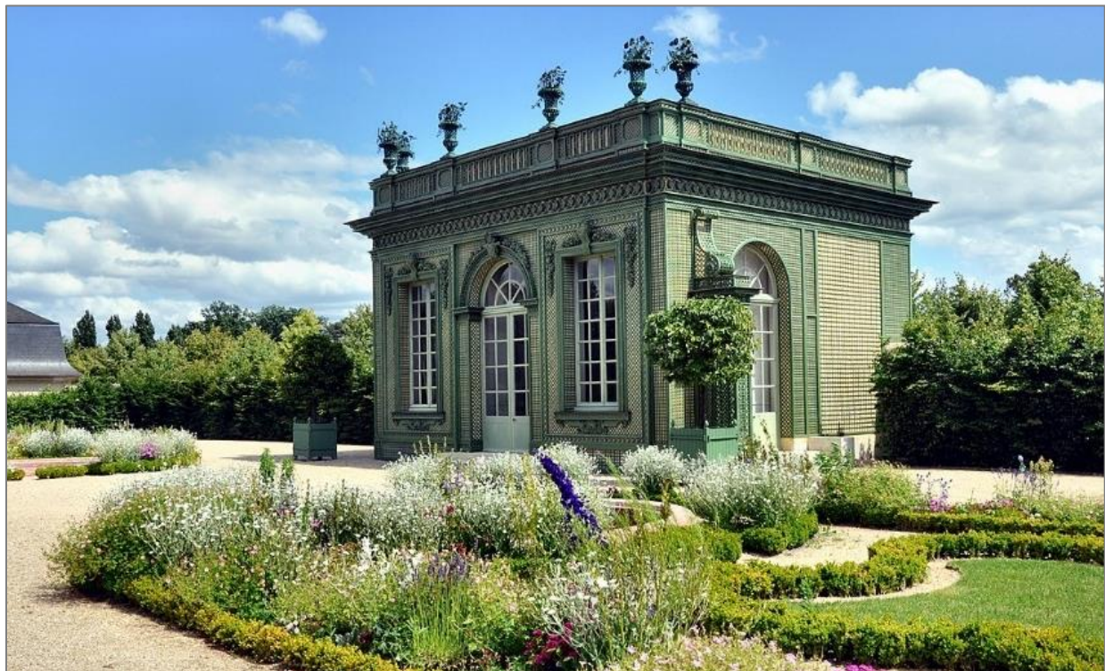
Le Pavillon Frais was restored by the American Friends of Versailles..

The American Friends of Versailles has, thus far, restored the 'Trois Fontaines Bosquet, the Pavillon Frais, the baroque, frescoed ceiling of the Queens' Guards Room, and the replanting of Virginia Tulip trees in the Queen's Grove. AFV has also donated financial support for the trees after the devastating storm in 1999, the research center at Versailles, international cultural seminars hosted there, as well as supporting traveling exhibitions of photographs and art from the Château. The American Friends of Versailles is dedicated to maintaining the American support and an active interest in this UNESCO-designated world-treasure in order to help preserve its history and beauty for future generations.