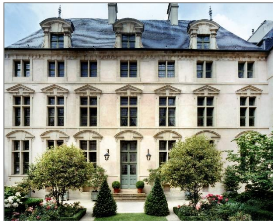
Hôtel Claude Passart