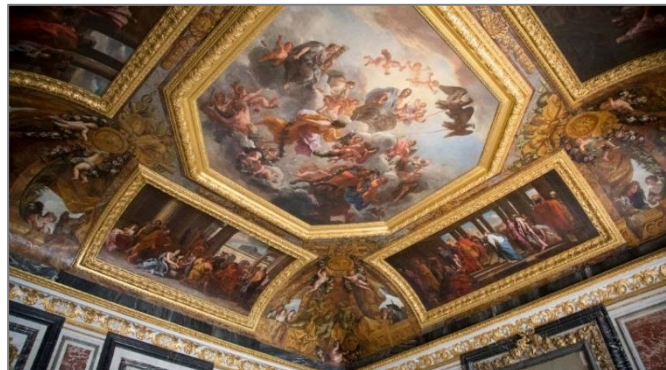
The ceiling of the Queen's Guards Room was restored with the help of the American Friends of Versailles.

GUIDED TOURS OF THE CHÂTEAU DE VERSAILLES. Begin with a visit to La Salle des Gardes de la Reine, the Queens' Guards Room. The American Friends of Versailles remains honored and humbled to have helped restore the exquisite ceiling frescoes and other architectural details in this room to their original beauty.