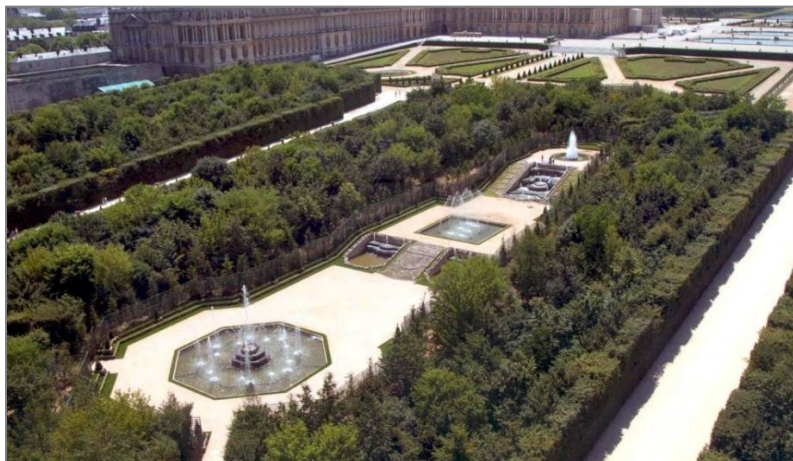
Le Bosquet des Trois Fontaines was restored with the help of American Friends of Versailles.

It is important to note the benefit dinner will be in the Grand Trianon with limited seating. All subscriptions will be processed in the order in which they are received (AFV will not hold reservations without full financial contribution.) Itinerary subject to slight changes. In addition, many of the incredible and rare privileges afforded us, are exceptional gestures of friendship and are underwritten by our French friends in honor of Americans who love France and who have taken a special interest in one of their most treasured museums, the Château de Versailles.