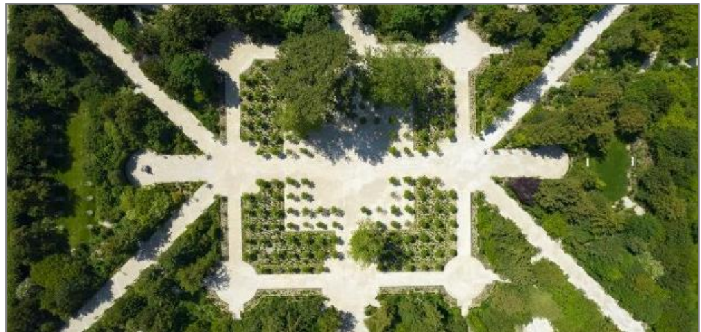
Le Bosquet de la Reine. Trees replanted with the help of the American Friends of Versailles.

DEJEUNER SUR L’HERBE IN THE BOSQUET DE LA REINE (PICNIC). The American Friends of Versailles supported the replanting of trees in the center of the Queen’s Grove, along with funding a bench. With its prominent location at Versailles, this grove replaced the famous Labyrinth Grove originally created in 1665-1666 and enhanced in 1677 with thirty-nine, painted lead fountains featuring enchanting animals from Aesop’s fables. This incredible maze wonder was torn down during the replanting of the Palace gardens in 1775-1776 and changed to the current grove, initially called the Grove of Venus and then the Queen’s Grove, reserved for Marie-Antoinette. This ornamental garden, extending the orangery Parterre, was