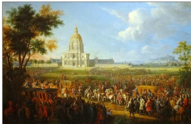
Louis XIV Visiting the Hôtel Royal des Invalides 1706

“In the 17 th century, Louis XIV was the head of Europe's greatest army. Aware that soldiers were the primary guardians of France's greatness, the Sun King decided to erect a building for those who had served the royal army. The Cité des Invalides first opened to veterans in 1674. At once a hospice, barracks, convent, hospital and factory, the Hôtel was a veritable city, governed by a military and religious system. Over 4,000 boarders lived within the site's walls. Today, the Hôtel still fulfills its initial function by housing the Institution Nationale des Invalides.” The most notable tomb at Les Invalides is that of Napoleon Bonaparte.