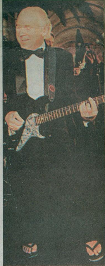
Jimmy Buffet entertained