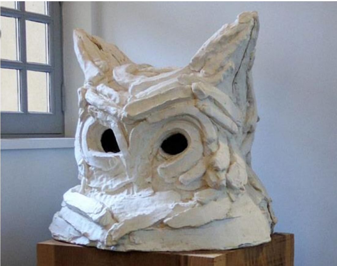
Able to rotate their heads 270 degrees, owls are said to emblemize the company's extraordinary vision.