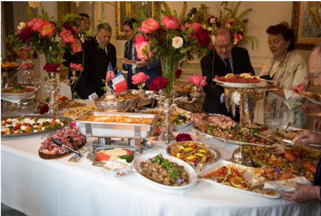
The lavish luncheon buffet.