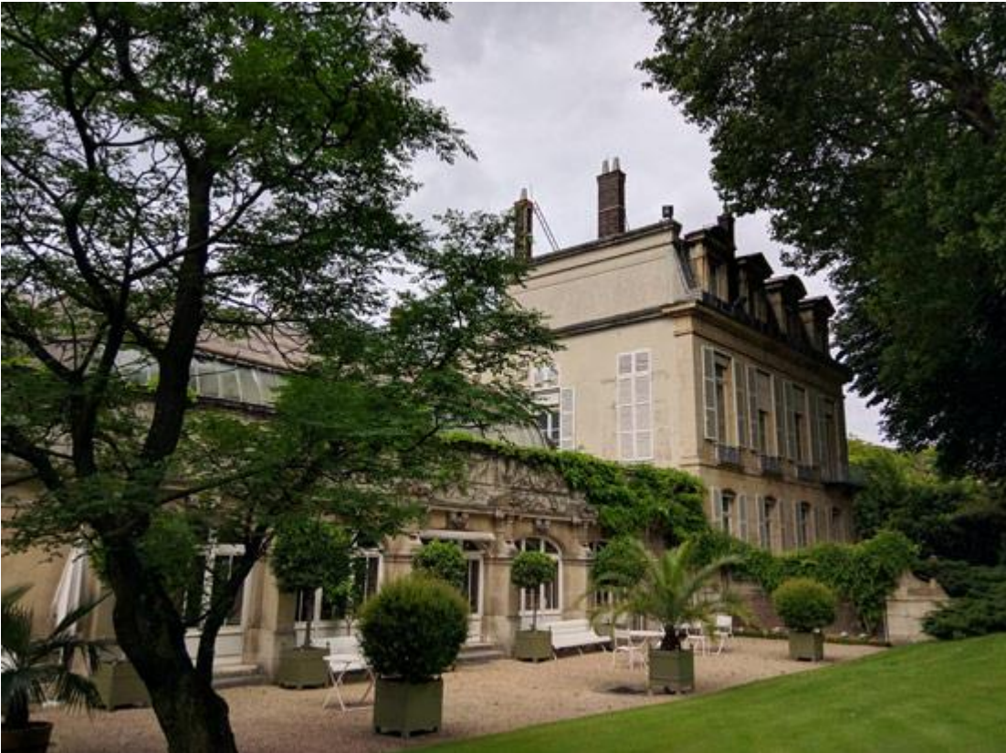
Visiting the halls and grounds of the French Senate's Luxembourg Palace built in the 17th century for Marie de' Medici.