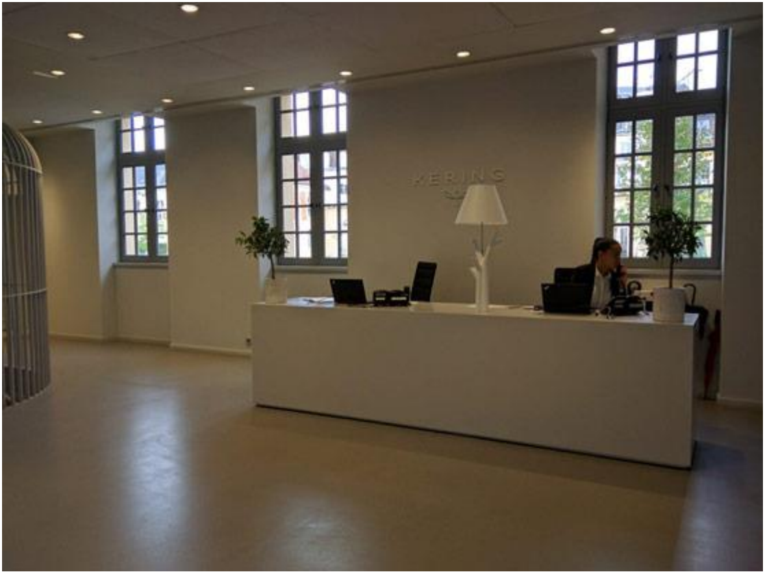
Pinault has maintained the ascetic character of the building in the reception room and throughout.