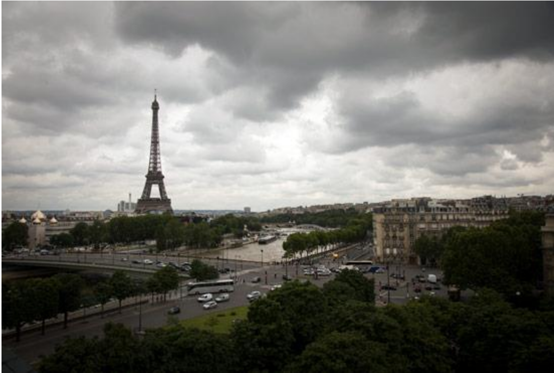
Terrace view of the Eiffel Tower from the apartment of HRH Prince Charles de Bourbon des Deux Siciles and HRH Princess Camilla.

Charles de Bourbon des Deux Siciles, and his wife HRH Princess Camilla . HRH Prince Charles is at the head of the historic French and Spanish Royal House of Bourbon. After cocktails on the garden terrace overlooking a spectacular view of the Eiffel Tower, dining room doors were opened to reveal an elaborate luncheon buffet. Grand Master of the Order of Saint George, HRH Prince Charles took the occasion to present AFV Founder Catharine Hamilton with an Order of Merit recognizing her contributions.