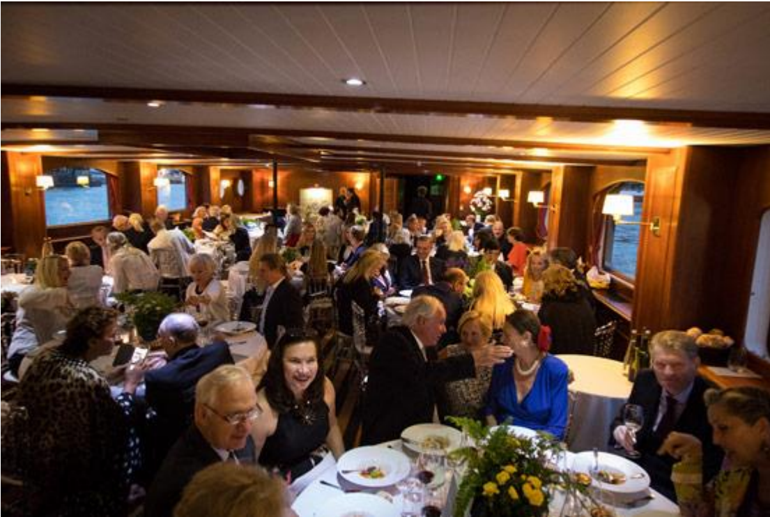
The dinner menu was gazpacho, salmon with foyot sauce, and a frozen wild strawberry bagatelle for dessert.