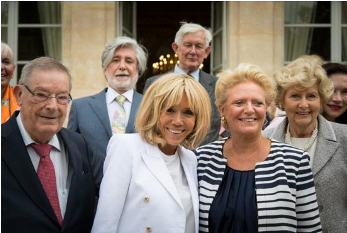
All of a sudden, First Lady Brigitte Macron bounded in to greet us.