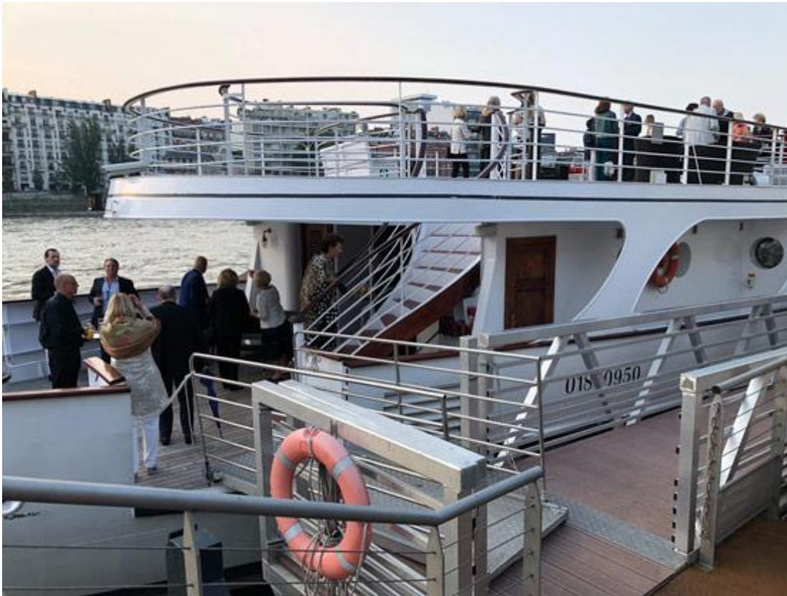
Boarding the yacht Excellence for a cruise on the Seine.