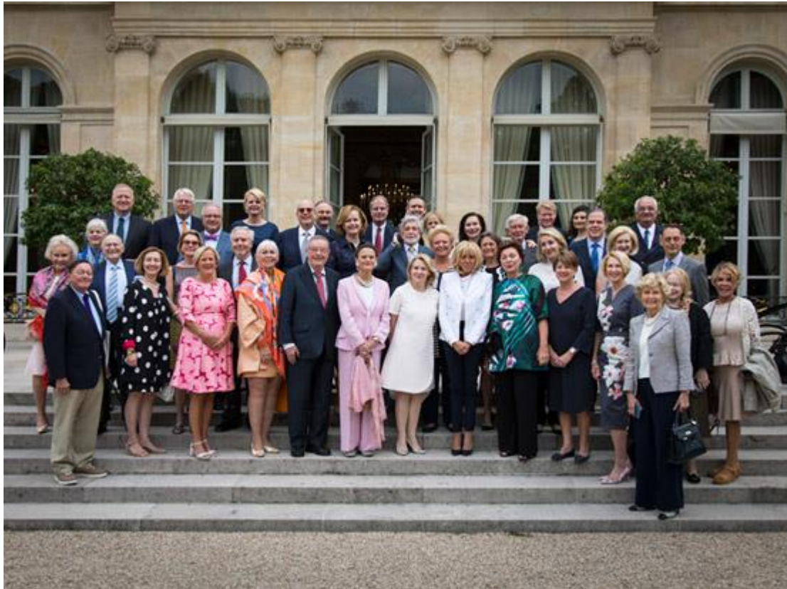
The AFV assembled on the garden steps of the Elysee Palace, with First Lady Brigitte Macron in front in the white blazer.

Having raised the funds to rescue historic ceiling paintings in Marie Antoinette's suite of apartments, the group gathered to view and celebrate the restorations. The formal events that took place at the palace will be covered in another post, but here is an account of some of the other privileged activities.