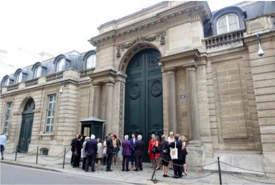
The AFV group gathered outside the American Residence.