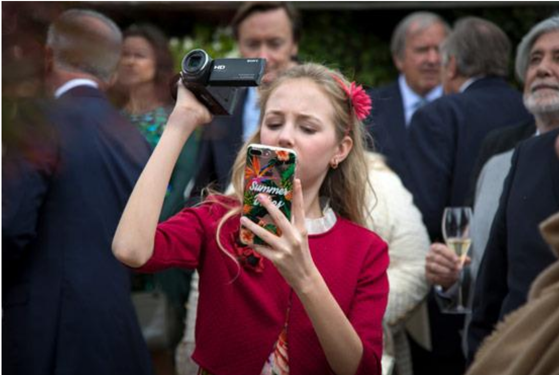
HRH Princess Maria Chiara, Duchess of Noto, records the speeches of welcome and introduction.