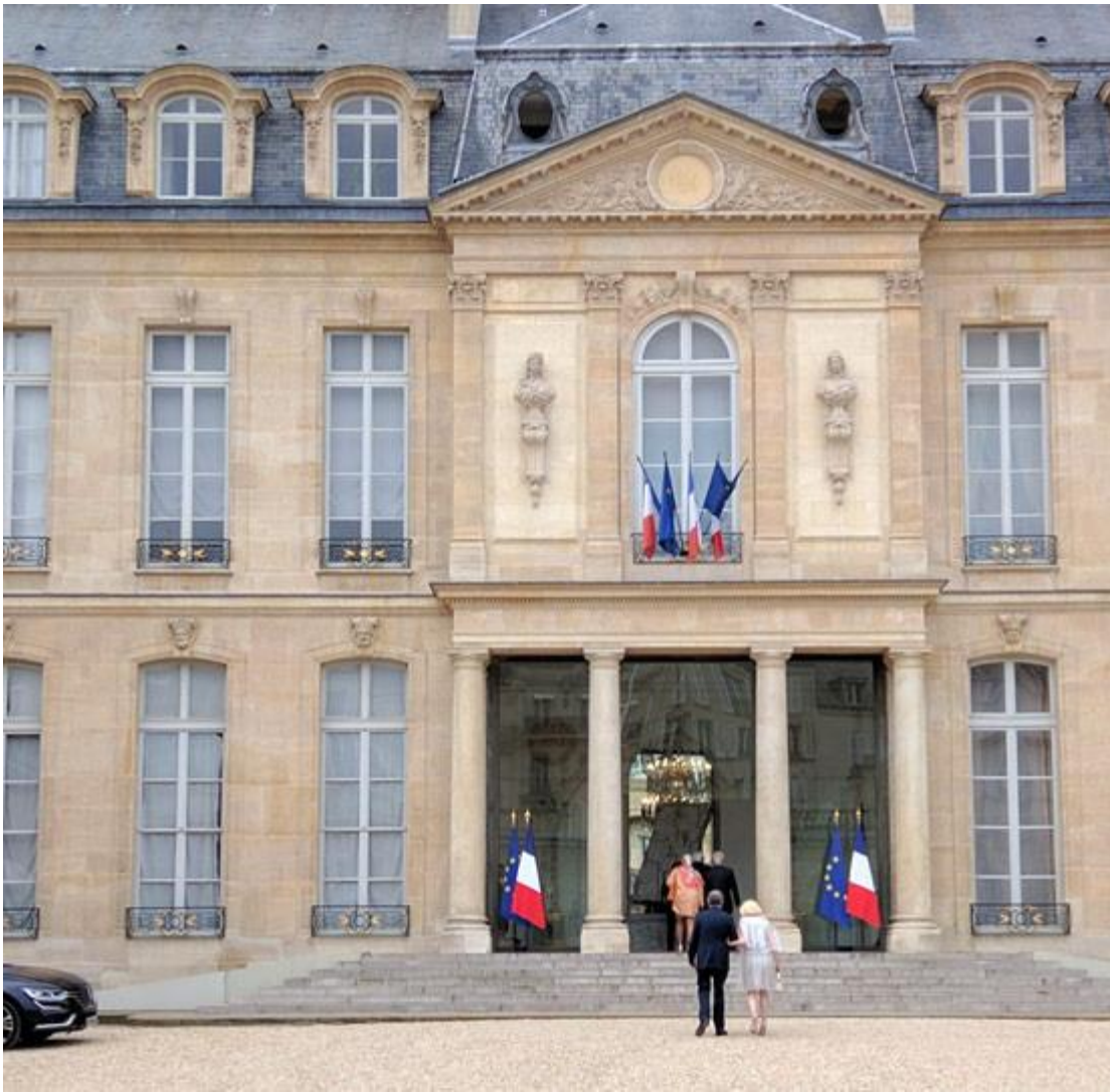
Our visit started at the Presidential Élysée Palace, analogous to America's White House.