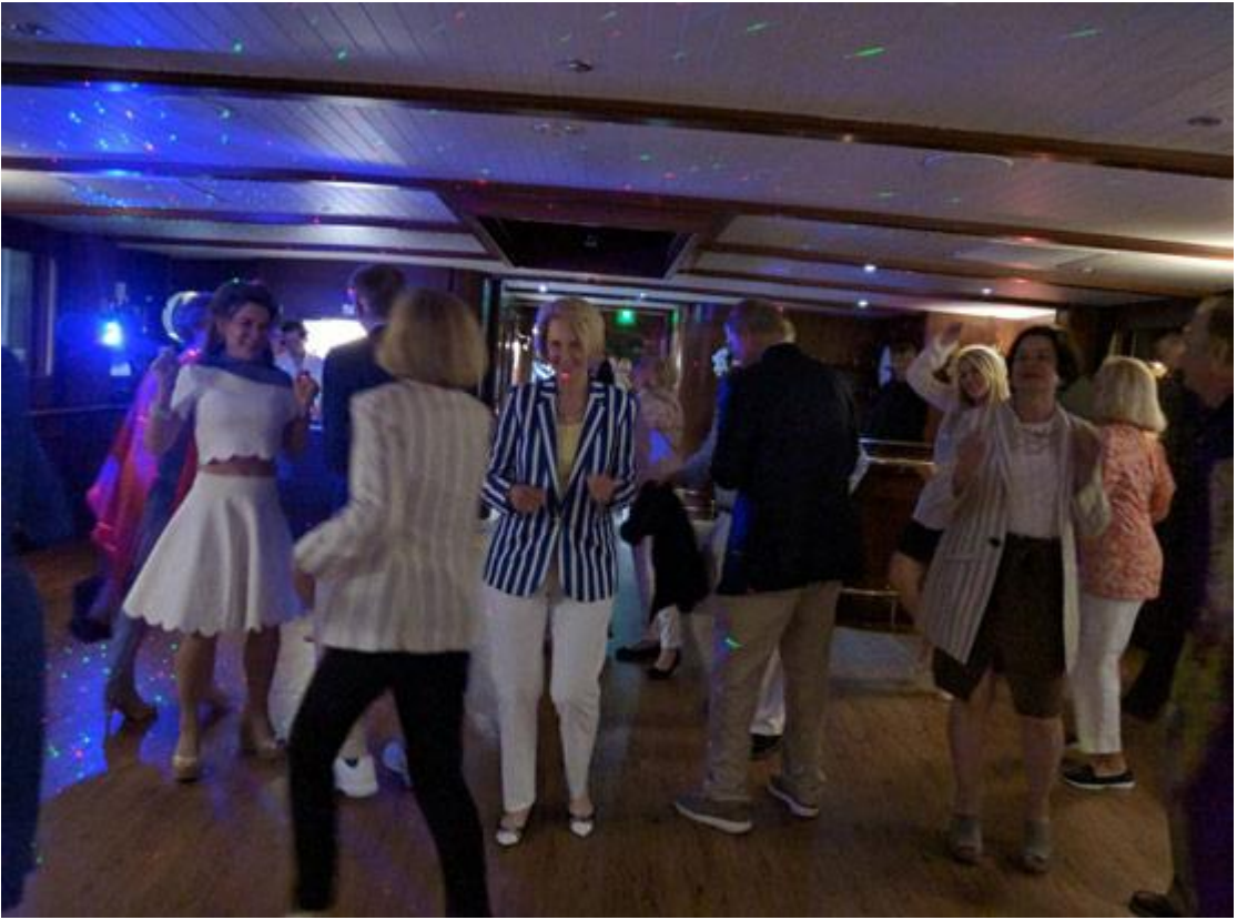
Disco dancing on the yacht.