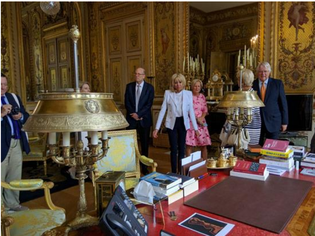
Family photos and a picture of De Gaulle on the desk of President Macron.