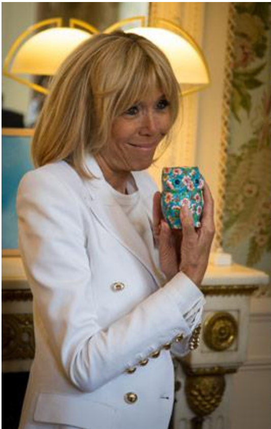
Keepsakes from friends help the first lady feel at home.