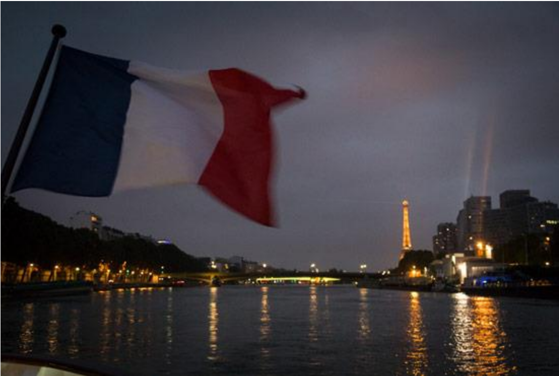
The Eiffel Tower aglow in the City of Lights.