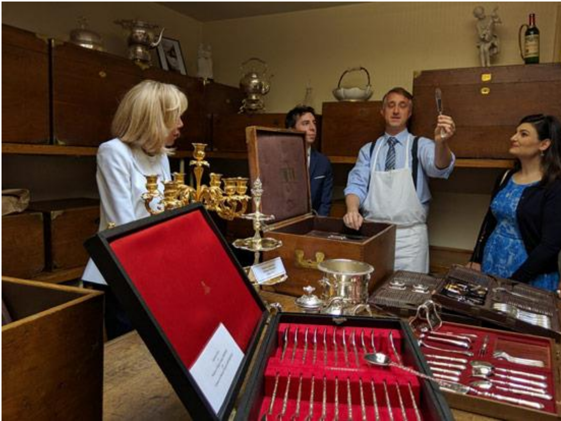
Silver flatware for state dinners includes unusual utensils.