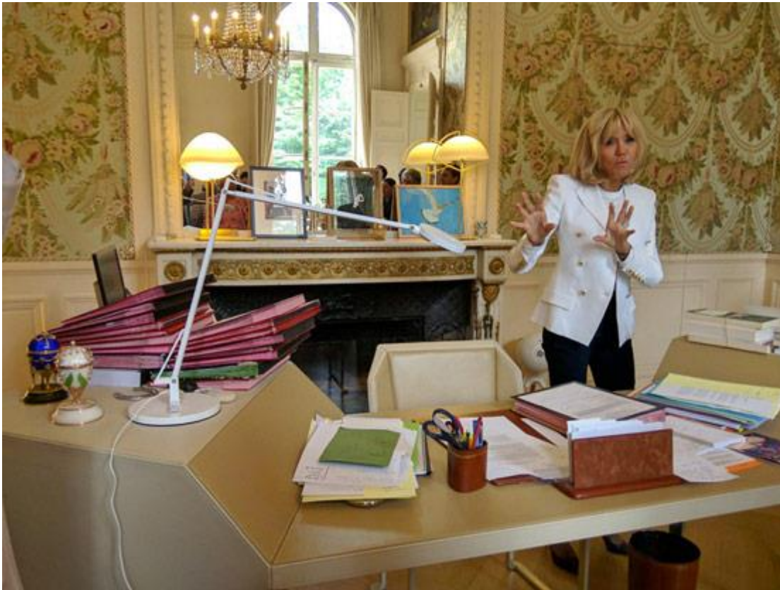
The first lady pointed out a pile of pink folders in her office. Pictures on the mantle were drawn by her grandchildren.