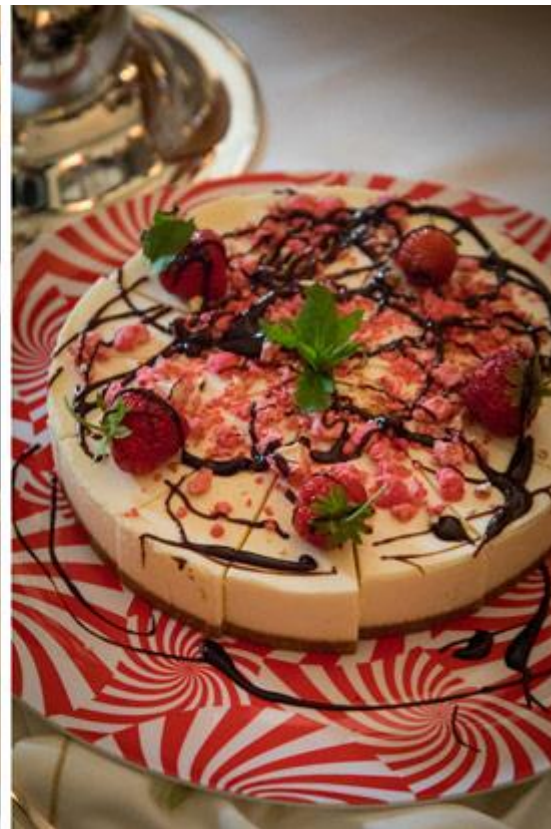
Elaborate desserts at the end of the meal.