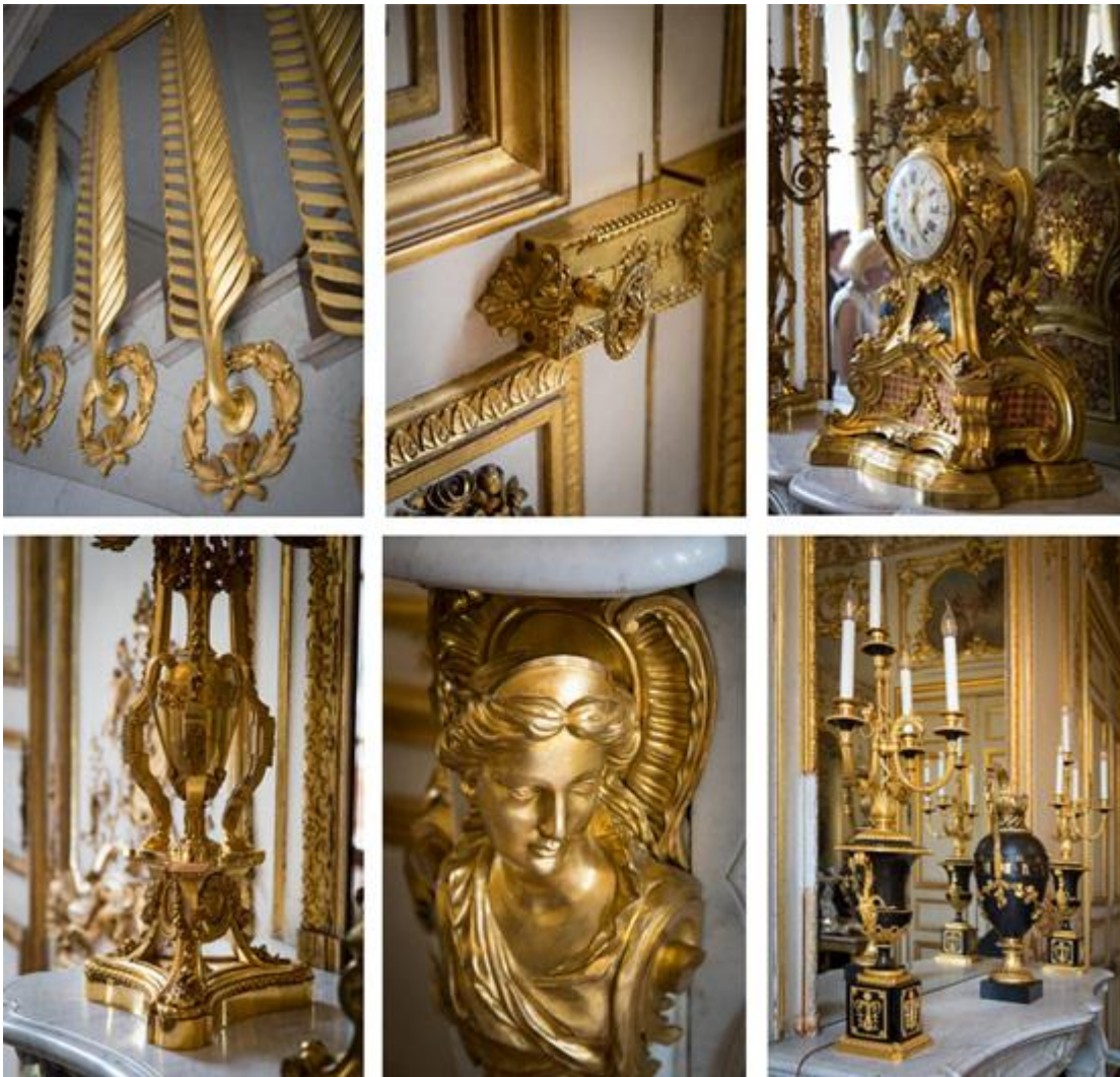
Originally built as the 18th-century Hotel D'Evreux, the Élysée is a fine example of French classical décor.