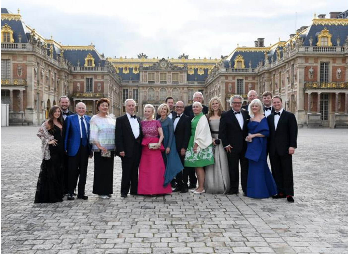
The American Friends of Versailles group in the courtyard at the Palace of Versailles. Celebrating their restoration of historic paintings in Marie Antoinette's Queen's Guard Room, members of the American Friends of Versailles (AFV) spent four days in Paris visiting dignitaries and monuments, dining and dancing.