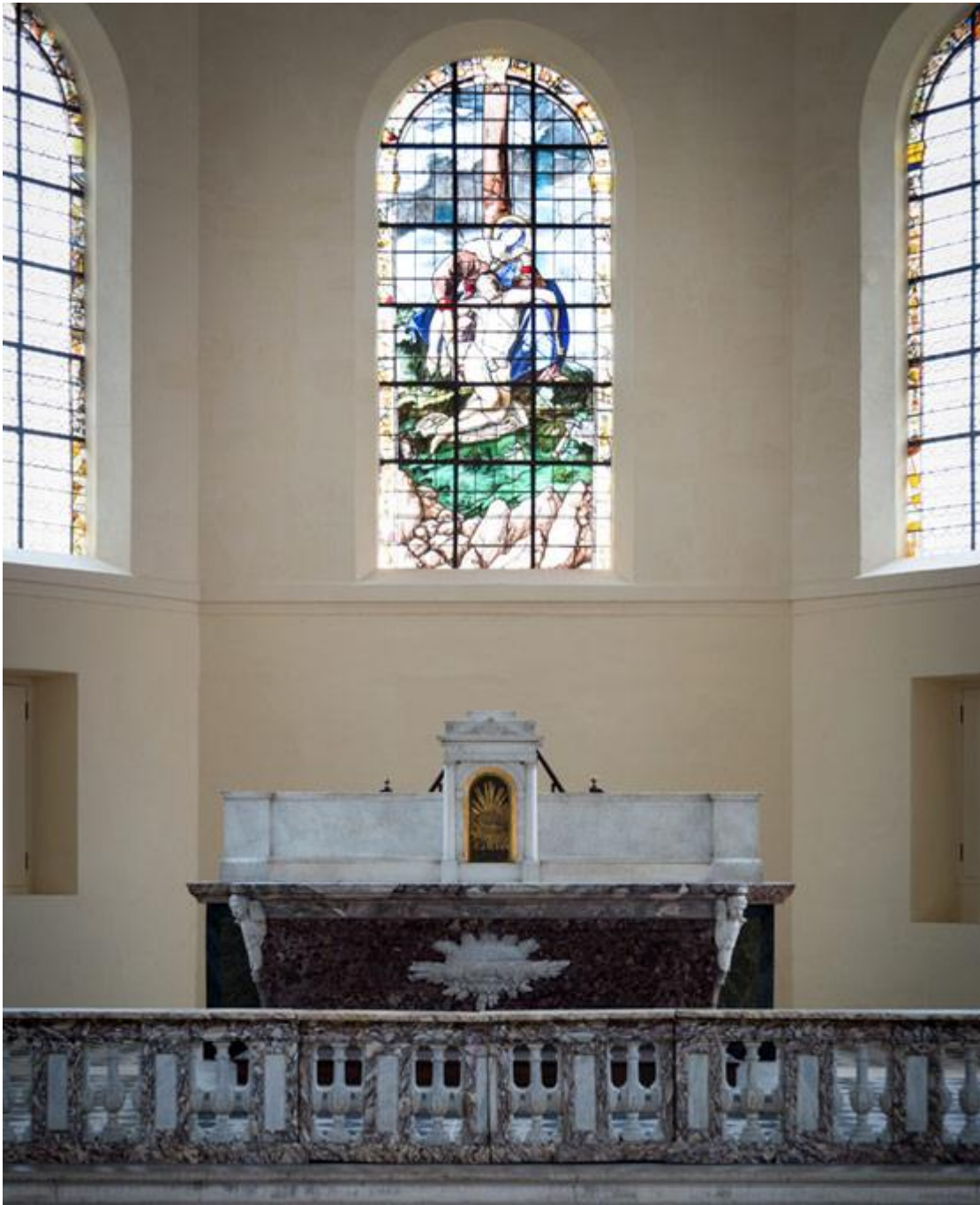
The chapel dates back to the reign of Louis III.