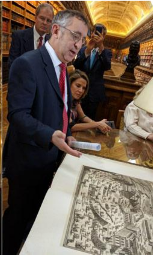
In the Senate Library, the curator presented a book with 1684 engravings of Versailles.