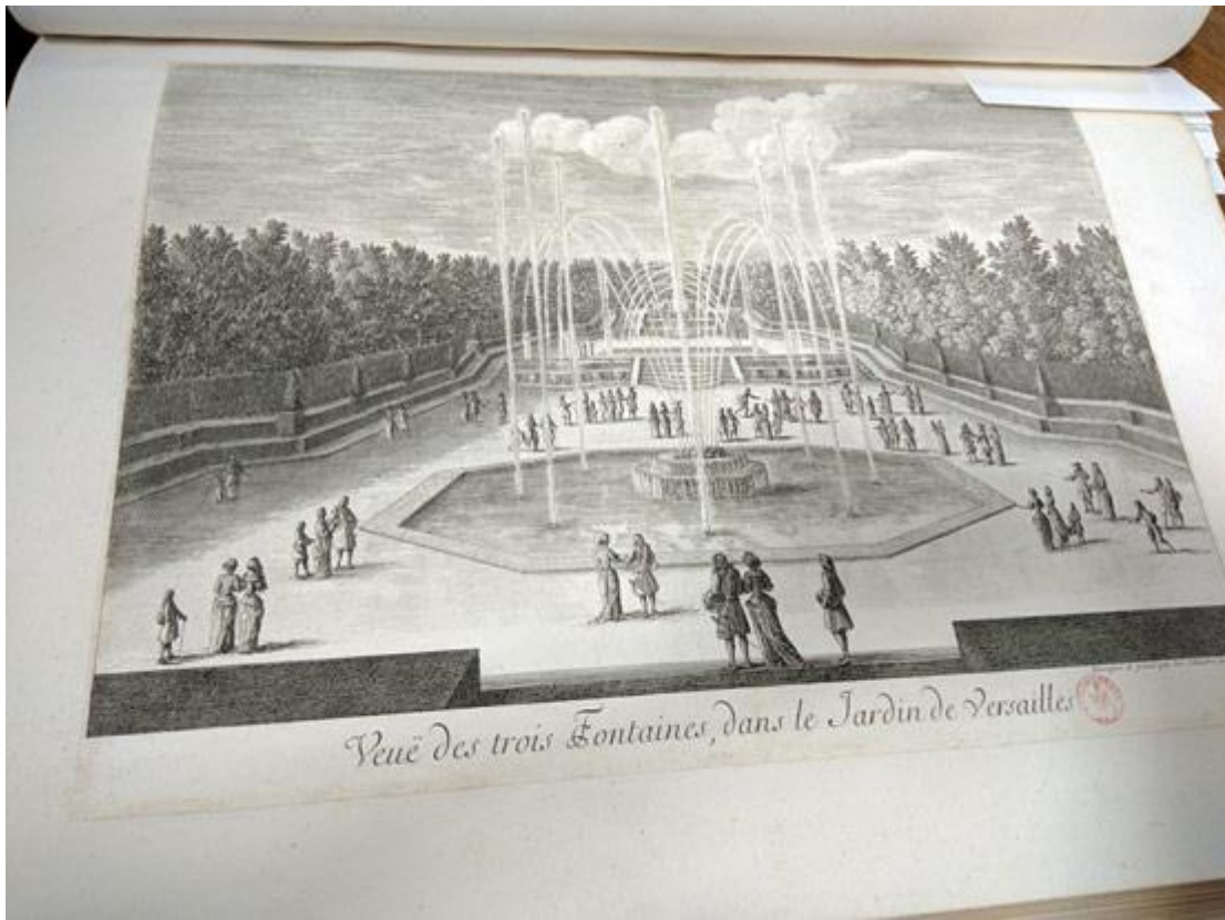
One engraving depicts the Bosquet des Trois Fontaines, the first AFV restoration project.