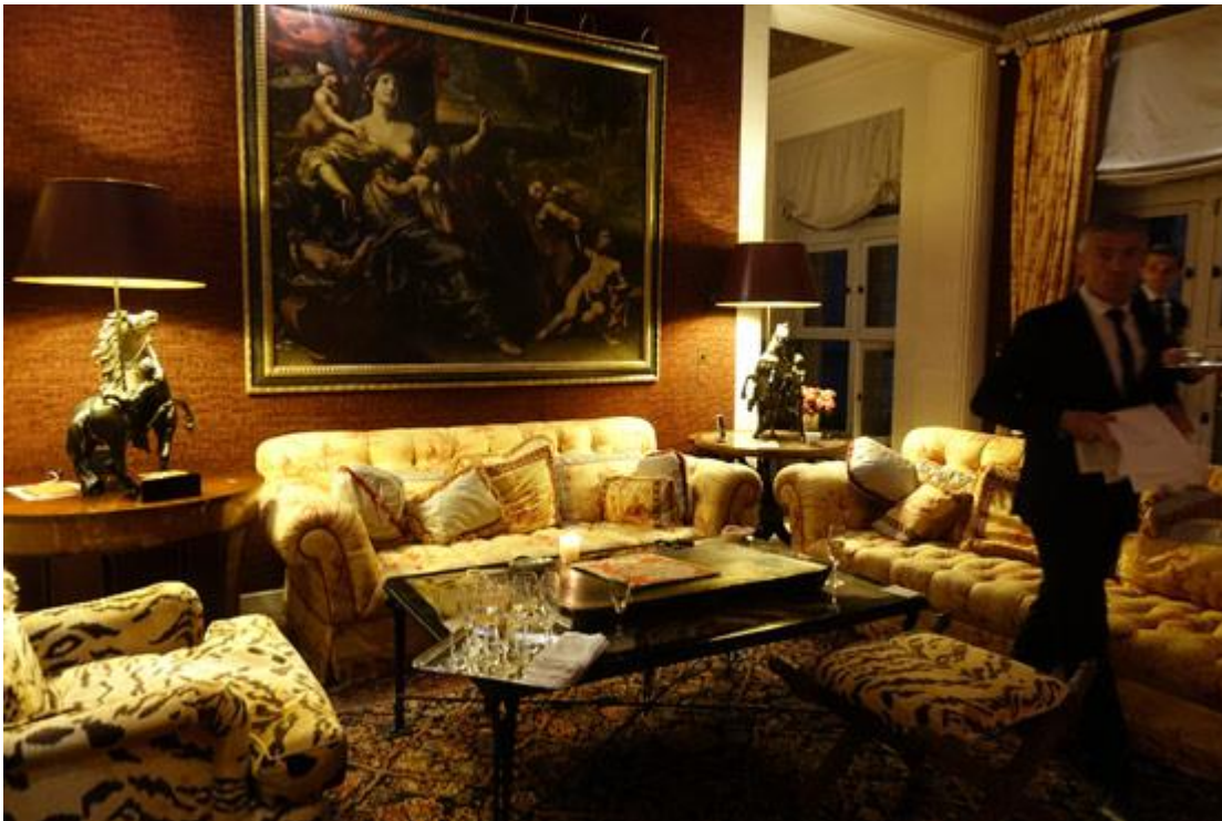
The home is a pinnacle of warmth and style.