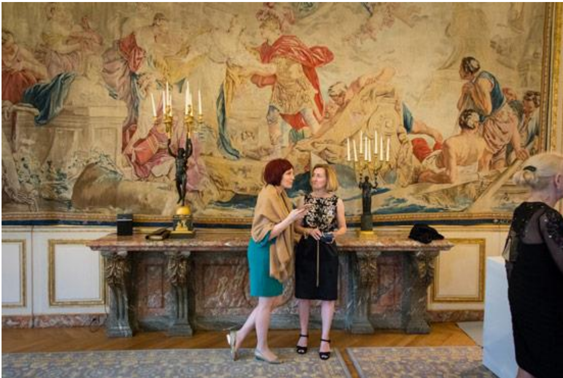
Tapestries decorate the Residence walls.