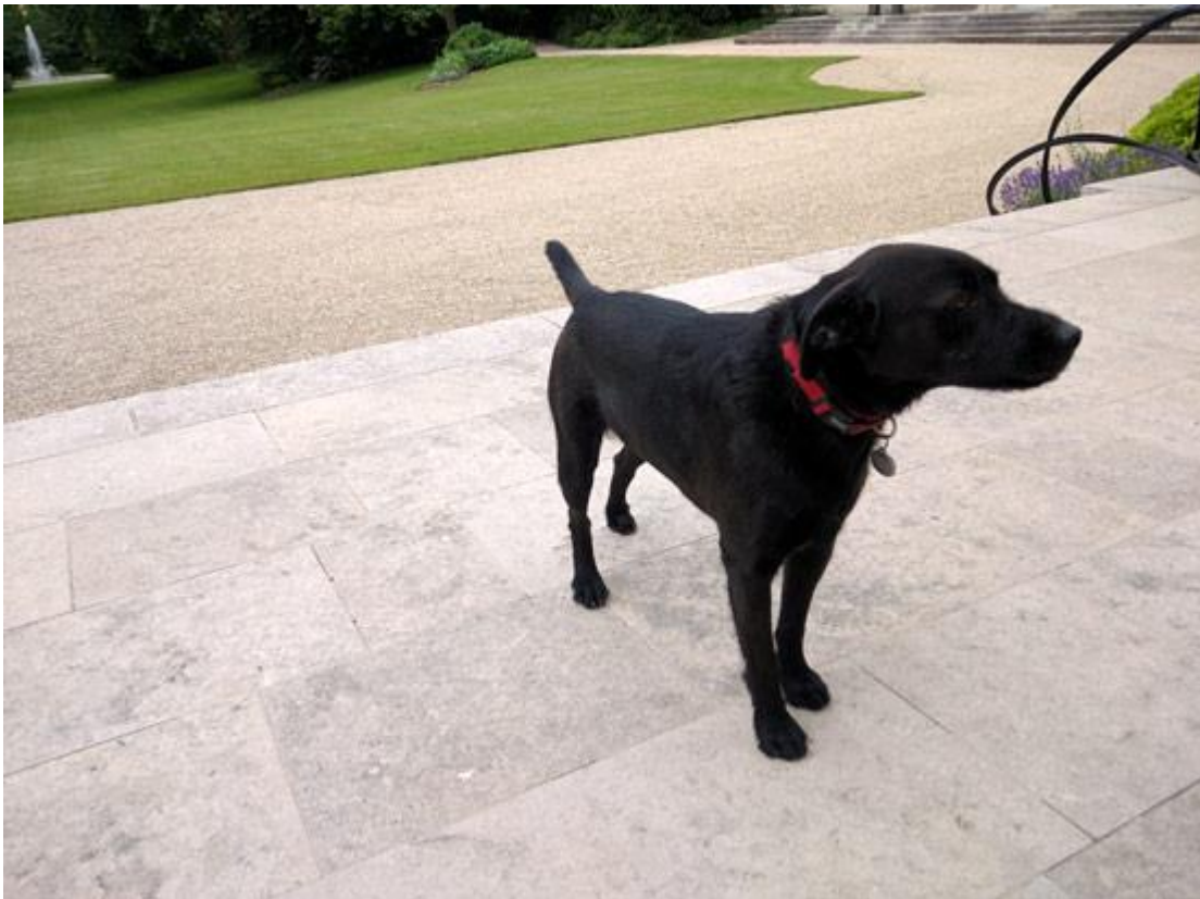
First Dog Nemo ambled in from the garden to greet us.