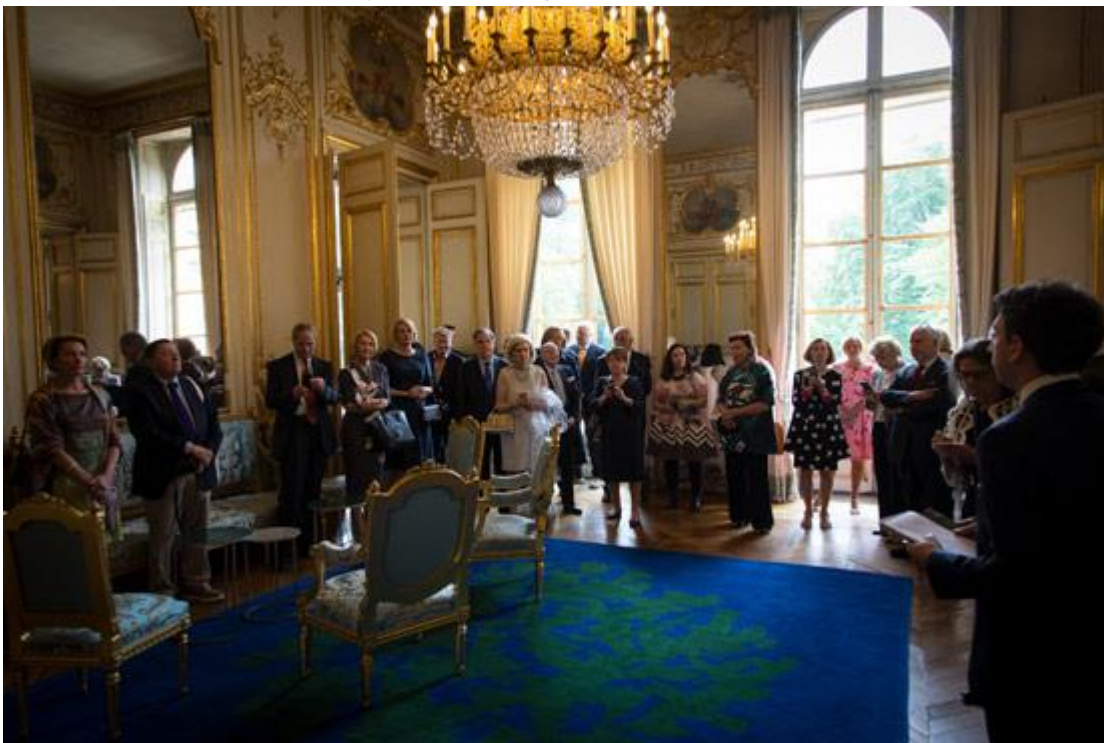
A guide led us through private rooms of the palace.