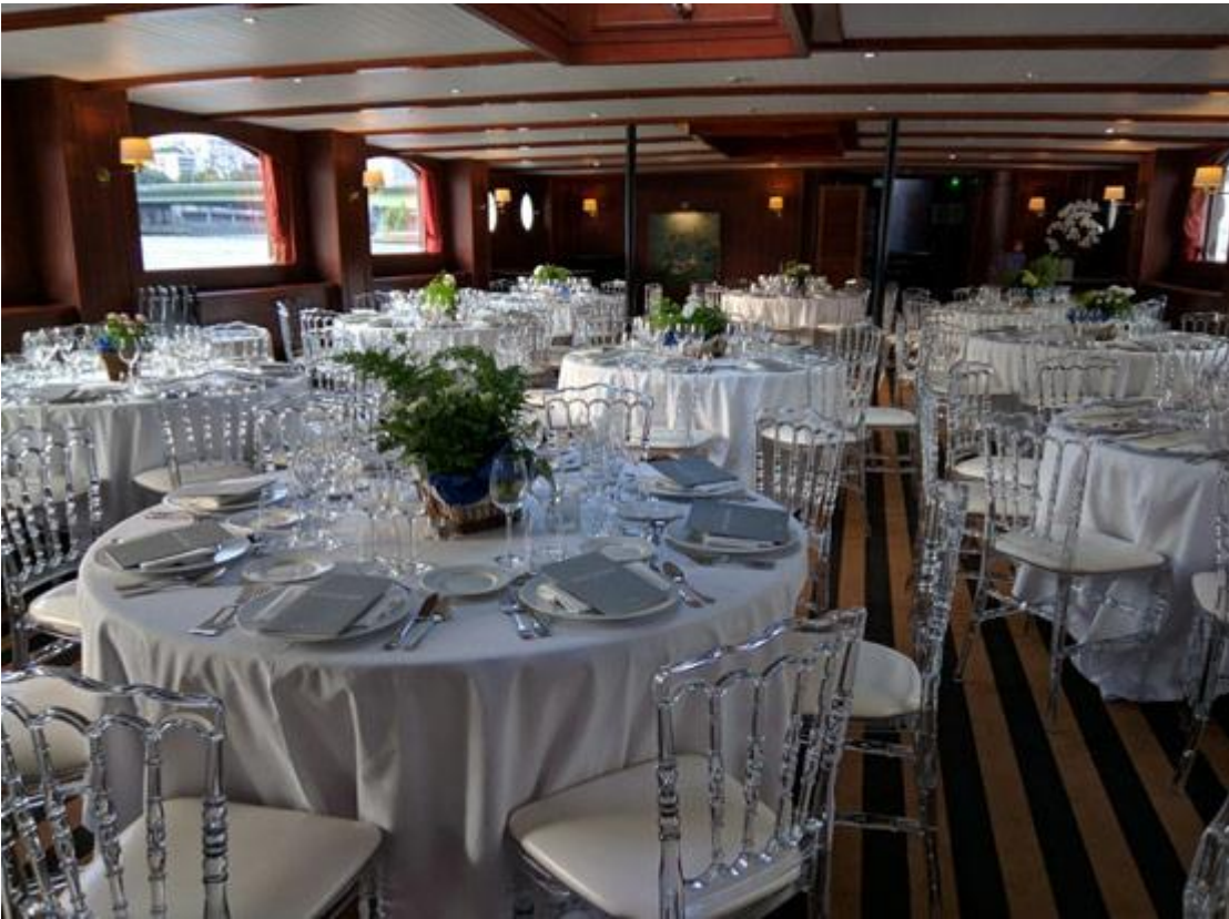
Tables set for dinner aboard the yacht.