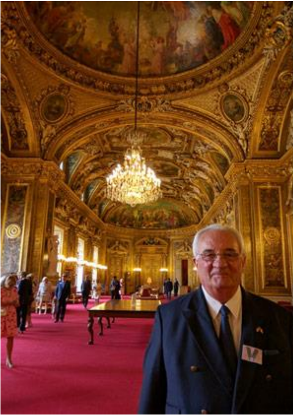
Jerome Fouan in the chambers of the French Senate.