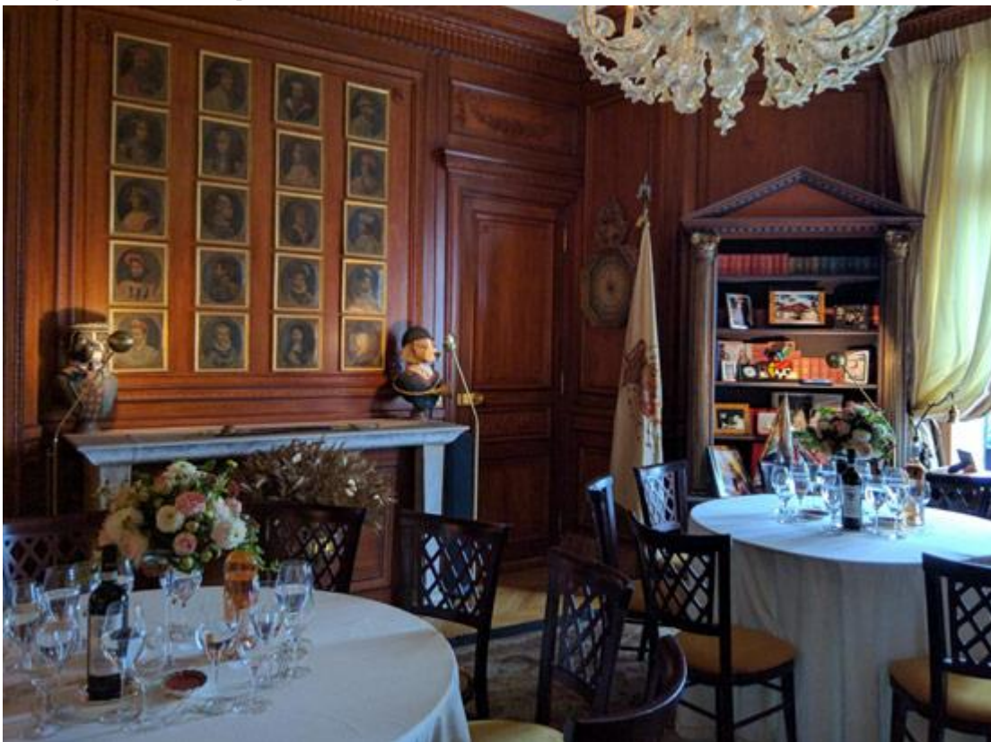
An apartment wall is lined with portraits of past kings of France.