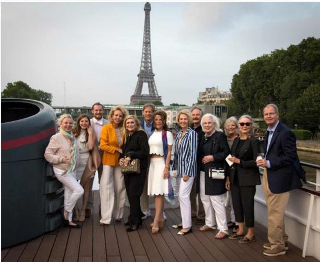
Sailing past France's scale model Eiffel Tower.