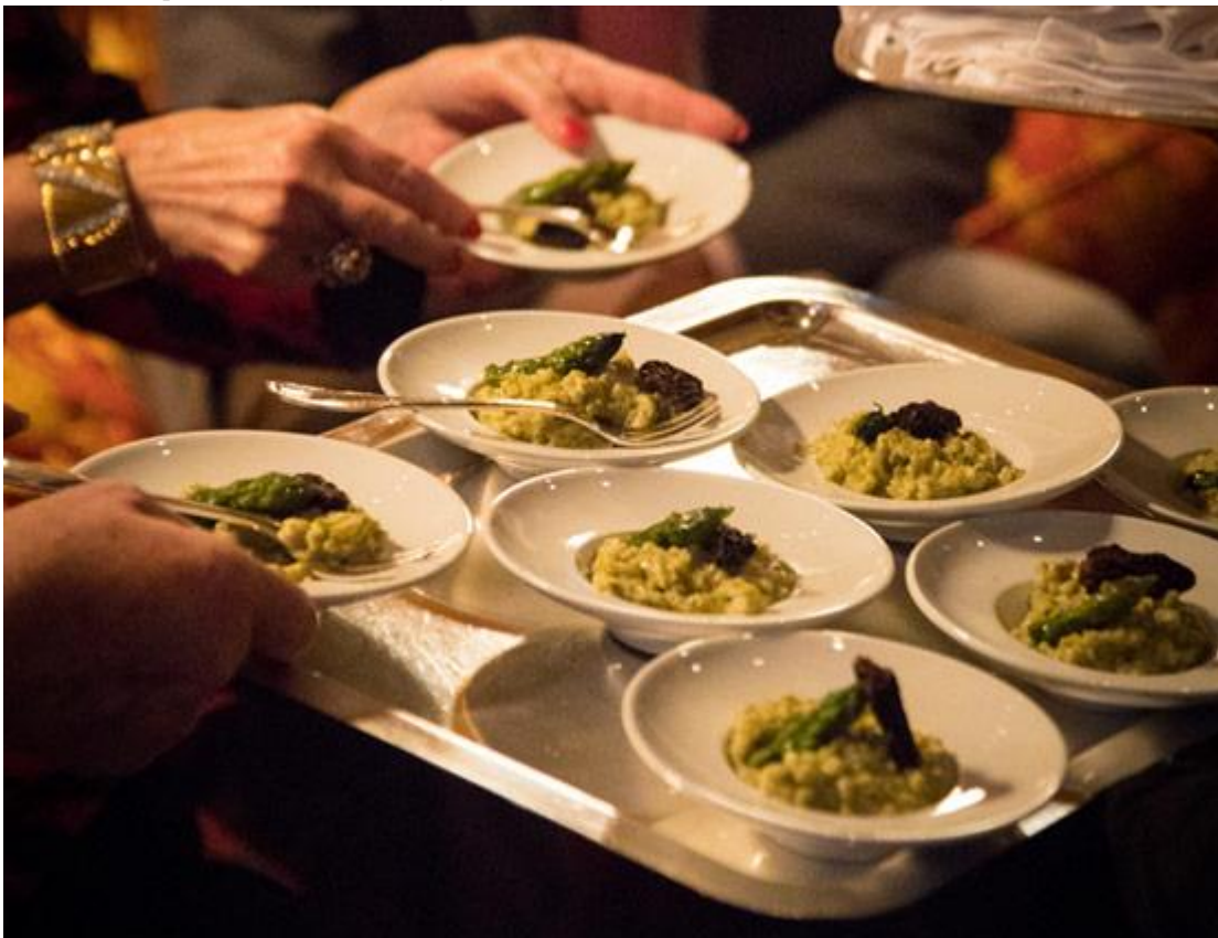
Truffle risotto was served in individual dishes.