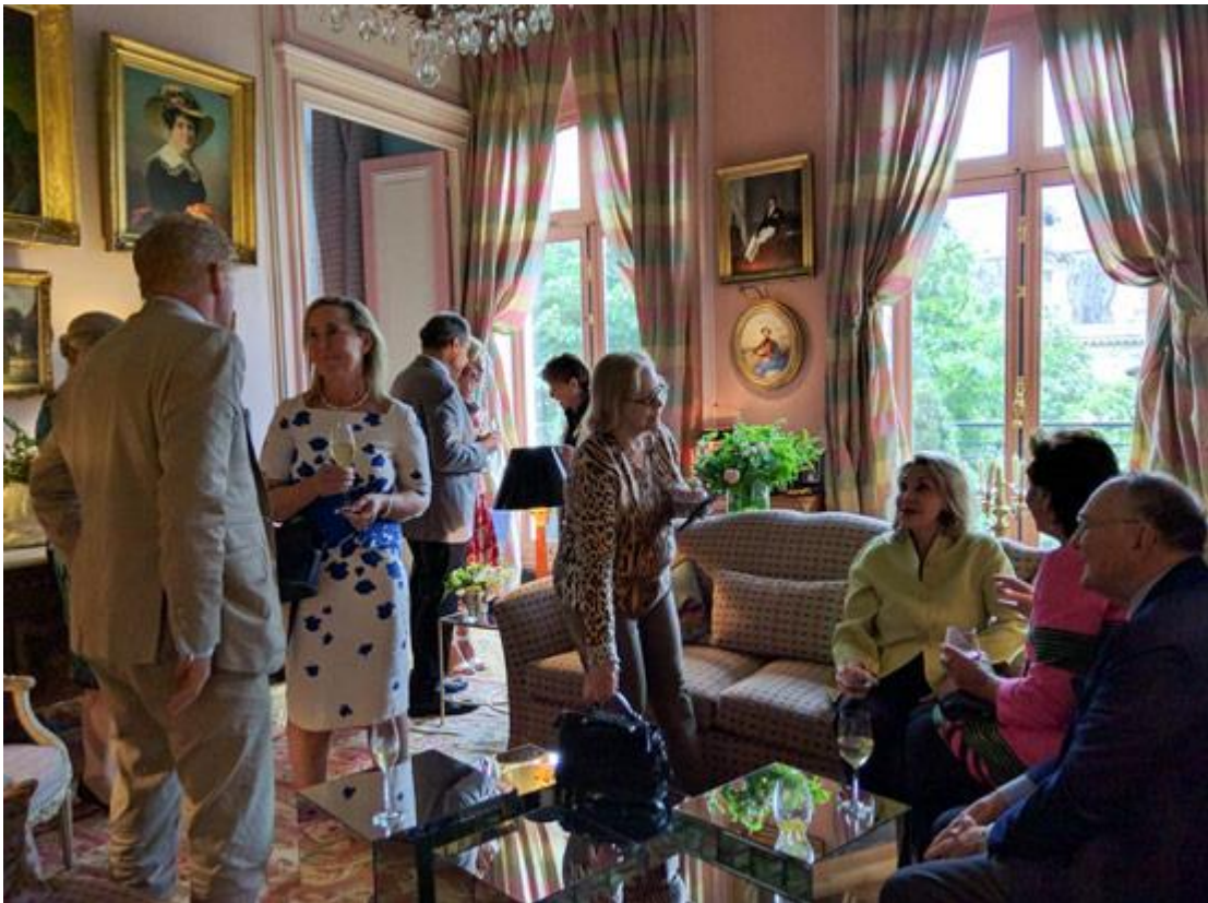
Guests assembled in the living room decorated in nineteen shades of pink.