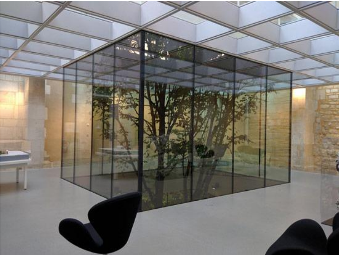
The hornbeam tree represents Pinault's start in the lumber business.