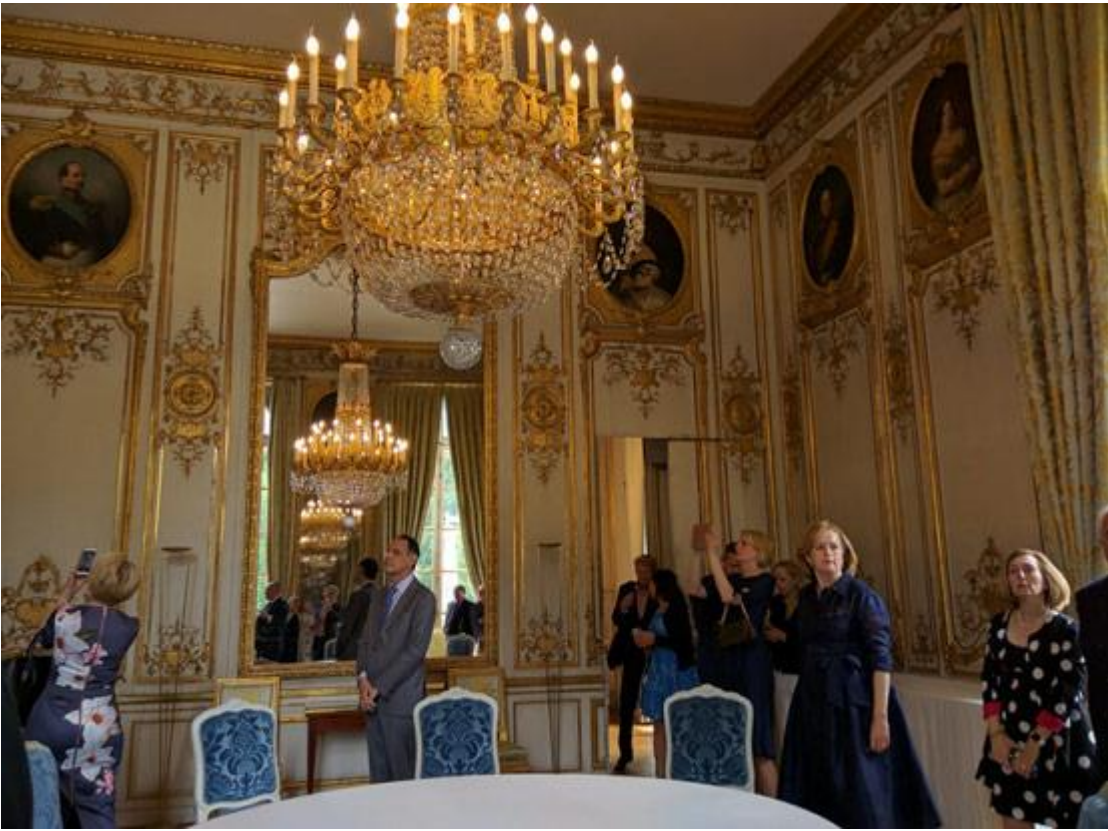
Admiring paintings in the Salon des Portraits.