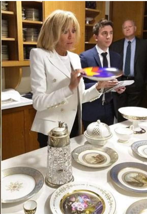
We saw the china patterns selected for state dinners. The first lady favors modern designs.