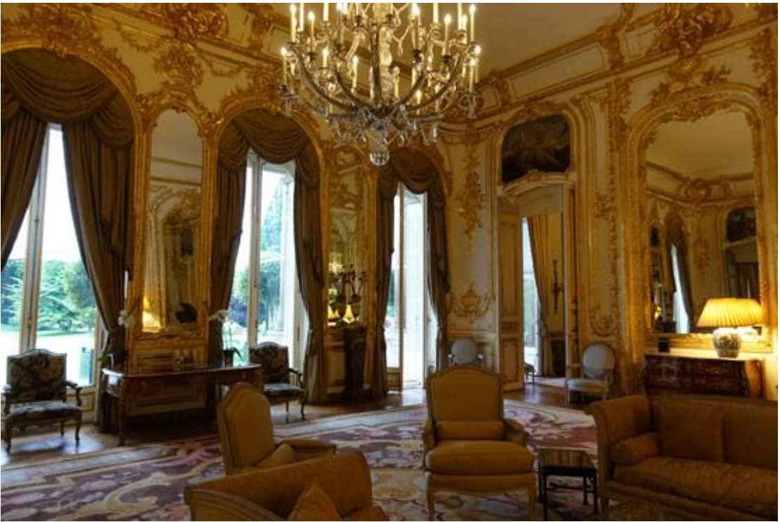
Windows in the Residence overlook the garden.