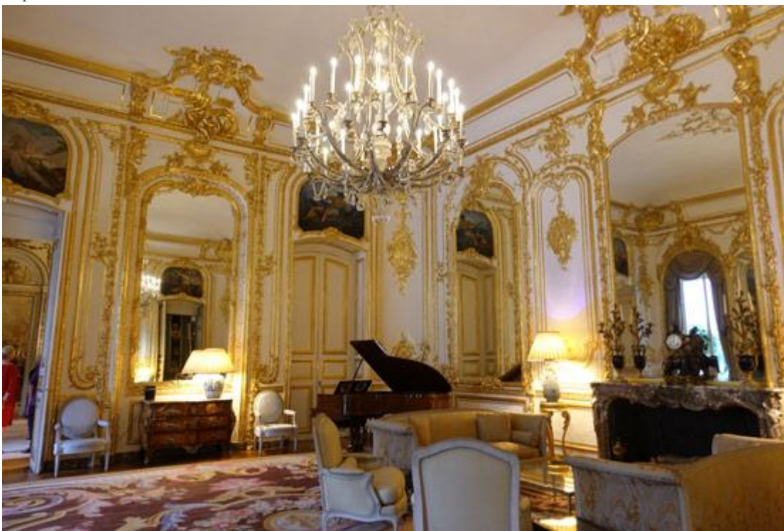
The Residence music room is highlighted with gold details.