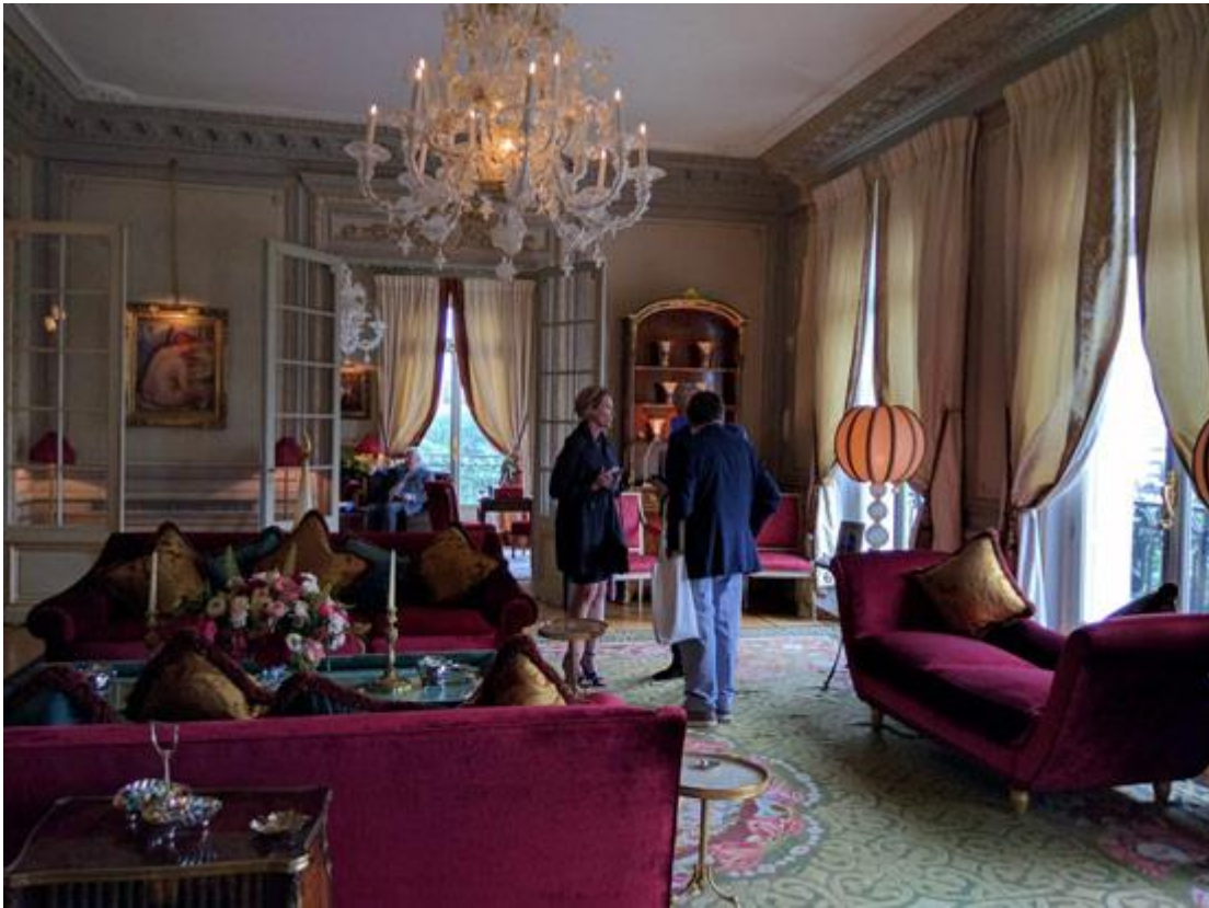
Living room of the ducal apartment.