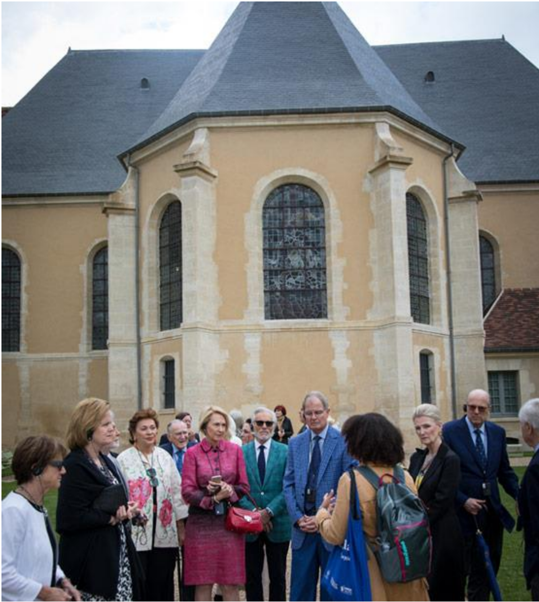
A guide led us on a private tour of the offices and courtyards normally closed to the public.