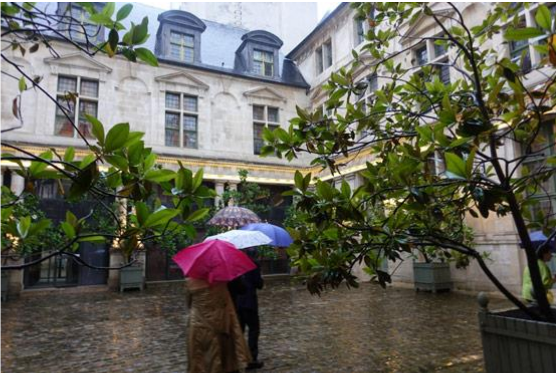
A rainy entrance to the Molyneux hotel particulier in the Marais.